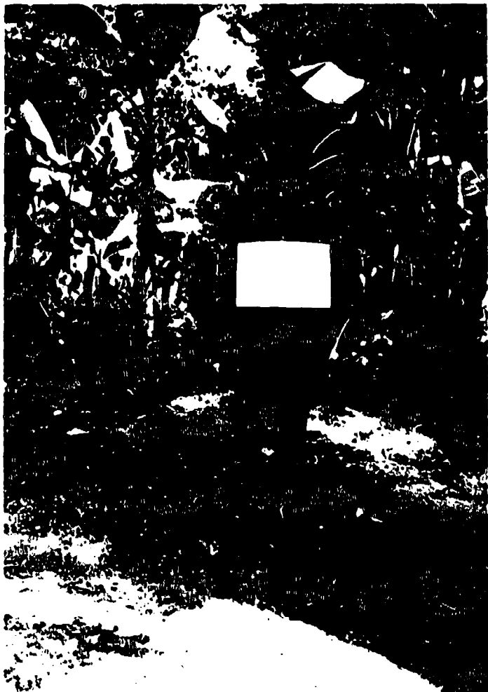
Name: TRAN VAN BINH Age : 39 years old Regiment 3 Vietnamese army Division 330