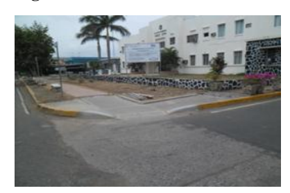
Accessible itinerary in Las Tablas giving access to government offices