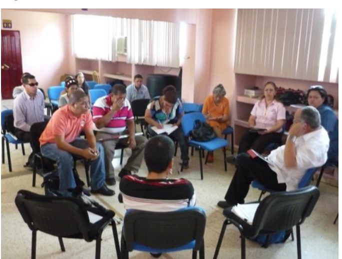
Premises of the Panamanian Institute for Special Training (IPHE), David, Chiriquí, 23 August 2012.