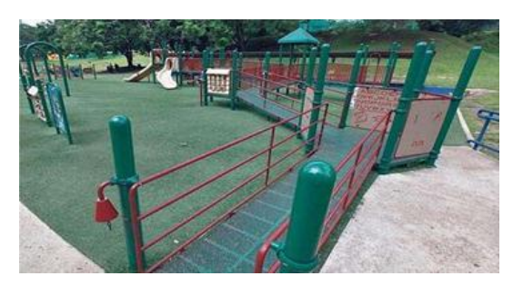
Access for children with disabilities in the Parque Omar