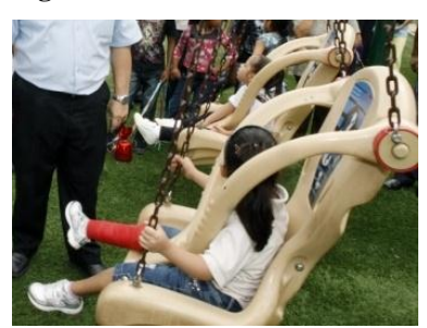
Swings for children with reduced mobility