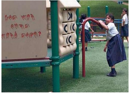
Special games for children with disabilities