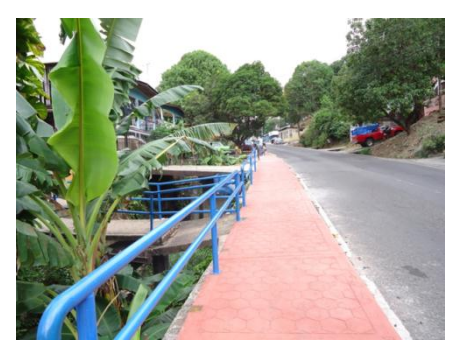
Access to the Mayor's offices in San Miguelito De San Miguelito