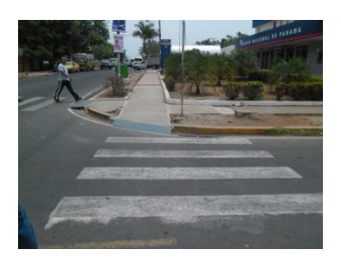
Access to the Nacional Bank of Las Tablas