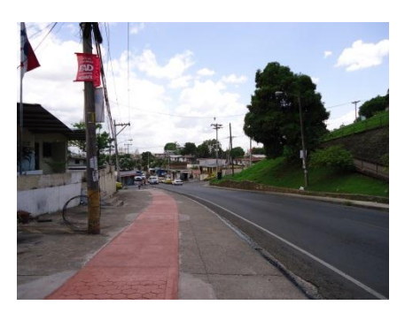
Access to the offices of the Town Hall of San Miguelito and schools