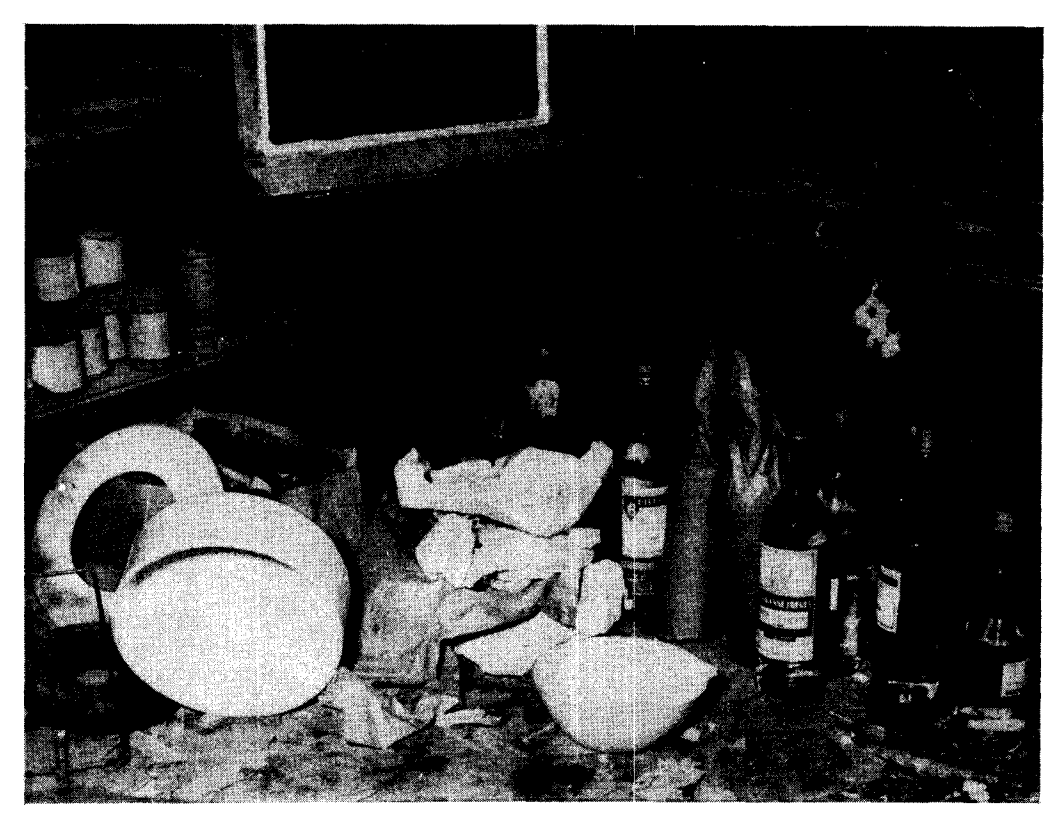
Window view (earthenware filter, porcelain bowl, alcohol, etc.) Angle fenêtre (filtre en faience, coupelle de porcelaine, litres d'alcool, etc)