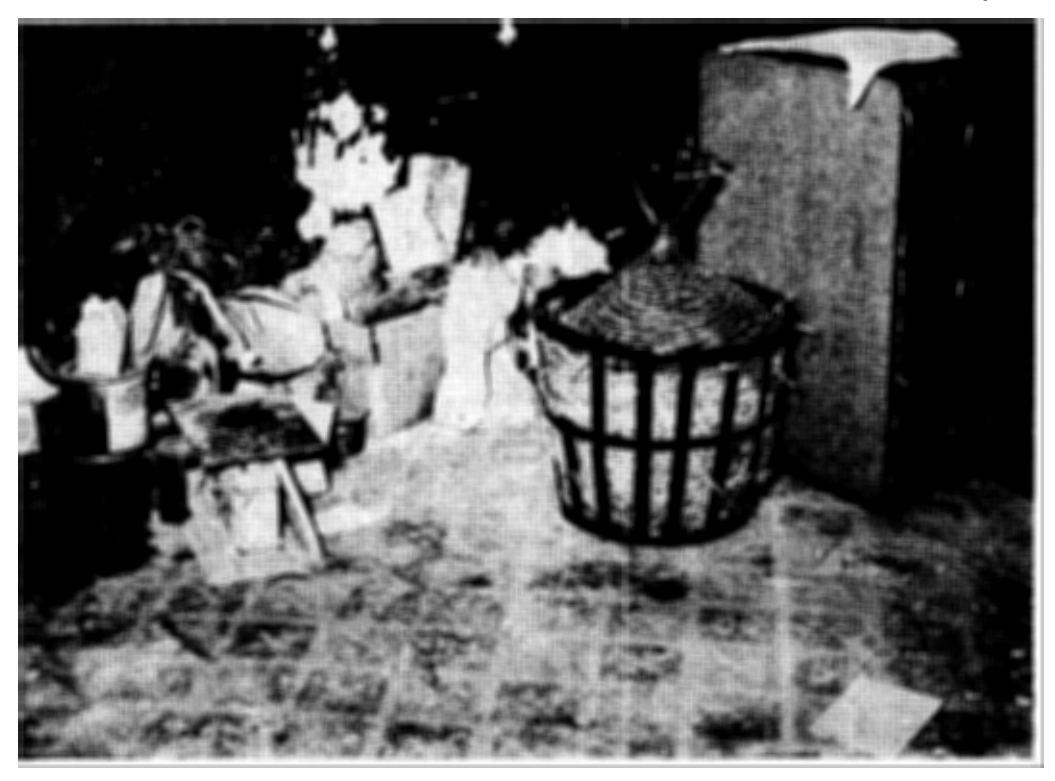
View right (carboy of distilled water) Angle droit (bonbonne d'eau distillée)