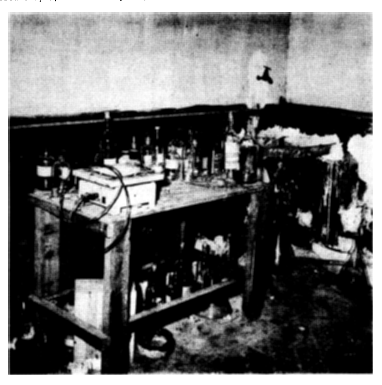
View left (sink work table) Angle gauche (évier, table de manipulation)

Griffel had only been in France one week and, by possessing only a transit visa good for three days, was violating the law covering aliens; she hoped to be able to pay for her room through the proceeds of the day. Djalai, who owed a week's rent, possessed only 1,000 francs ($2.86).