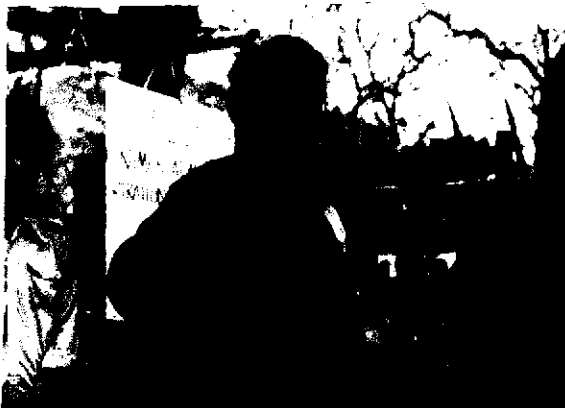
A survivor: "No warning..."

The shells hit camp districts Nos. 2, 3, 7, and 8 exclusively. According to the list of casualties submitted by camp leader Chum Chheang, of the 15 people killed, only 3 were adult males: a young man of 22 and two older people in their fifties. The others were either women or children under the age of 12.