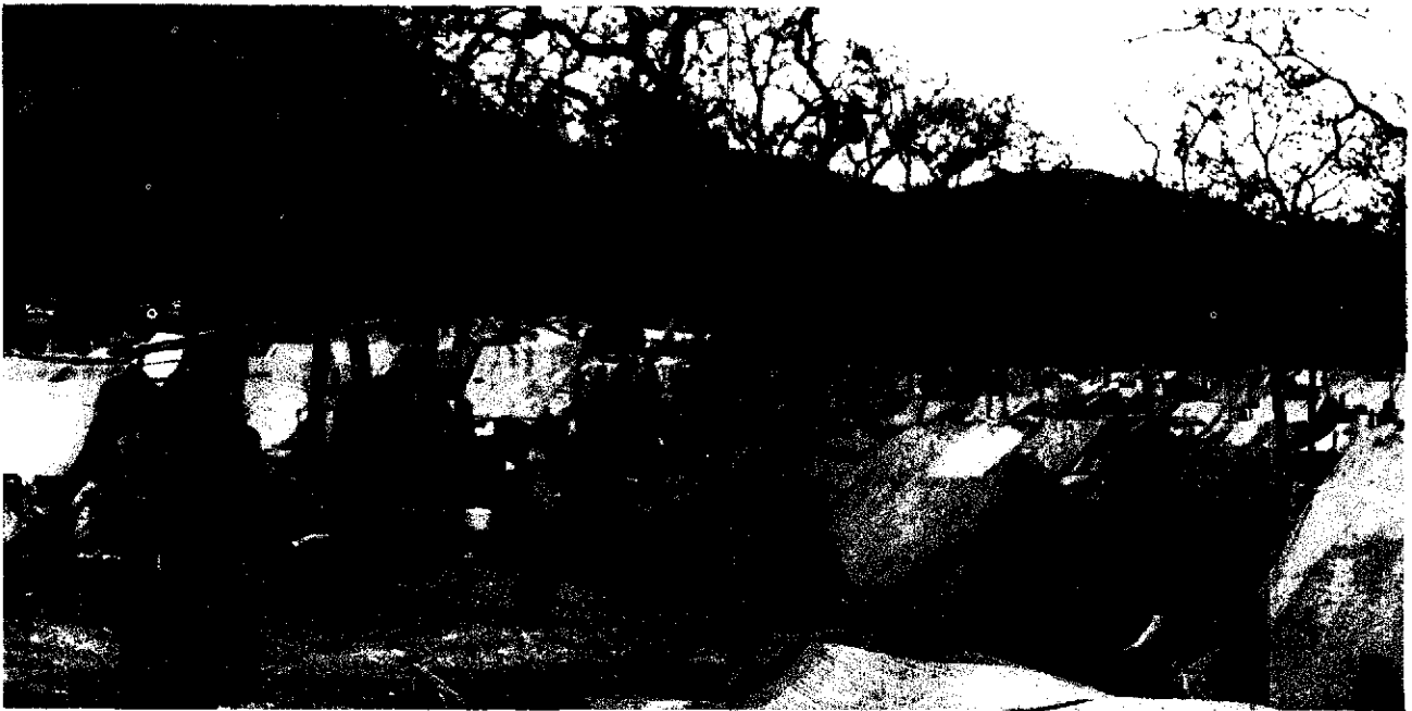
Temporary site for refugees from Dangrek camp: ... scorching heat of the days and relative cold of the nights of the Dangrek mountain range only a few hundred metres away (in background).

The attack against Dangrek represents yet another episode in the escalation of violence and atrocities by Vietnamese occupation forces against the Cambodian people. It forced all 23,000 civilian inhabitants of the camp into Thailand, thus adding further suffering on the hapless refugees, not to mention the extra load imposed upon the already heavy refugee burden of the Royal Government of Thailand. By sending them away from their homes in Dangrek, the Vietnamese purposely wanted to deprive them of what little comfort left to them in a long time and threw them back once again defenceless against the scorching heat of the days and relative cold of the nights of the Dangrek mountain range only a few hundred metres away.