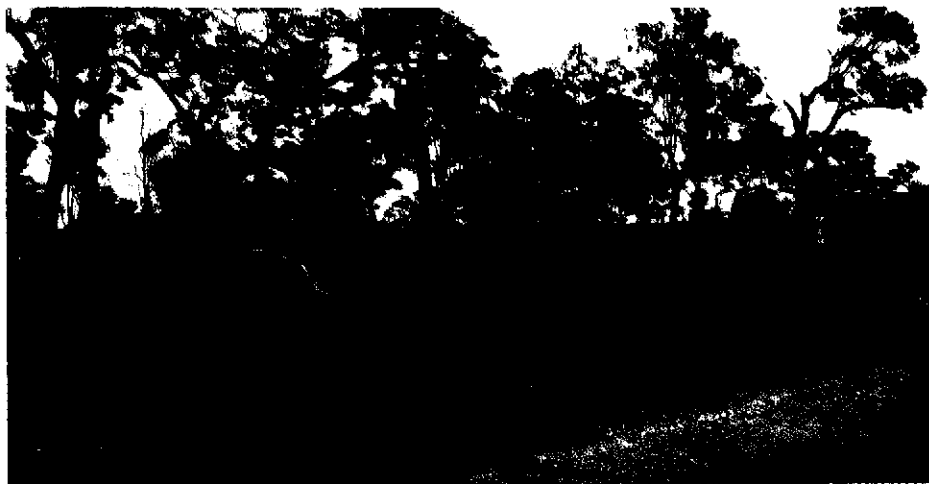
Dangrek, a peaceful settlement where a semblance of normalcy prevailed. This picture shows a group of Buddhist monks on their way to the village.

In many respects, Dangrek camp had somehow become a model for other refugee camps along the Thai-Cambodian border.