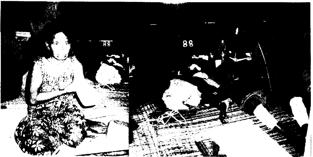
Mostly women and children under the age of 12 years old.