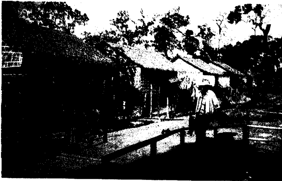
Dangrek camp: ... a model for other refugee settlements along the Thai-Cambodian border.