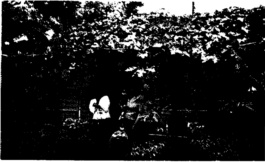
...each family in the camp grew its own vegetables...