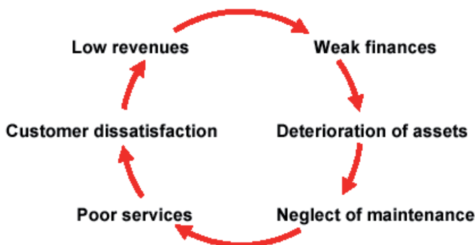
Figure 1: The stagnation cycle of WSS utilities in Africa