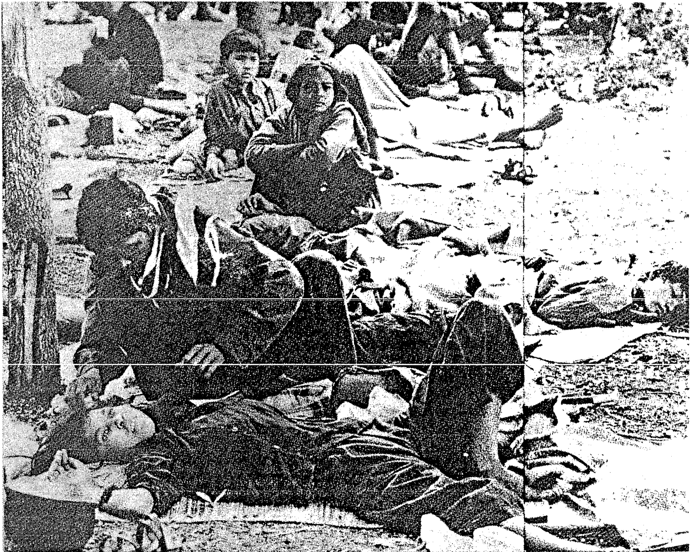
Japanese Photographer TADAO MITOME, in 1980