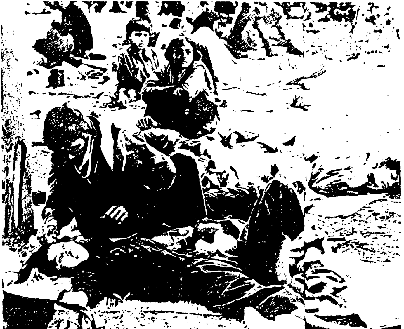
Japanese Photo Paper TASA 117001, ca. 1940