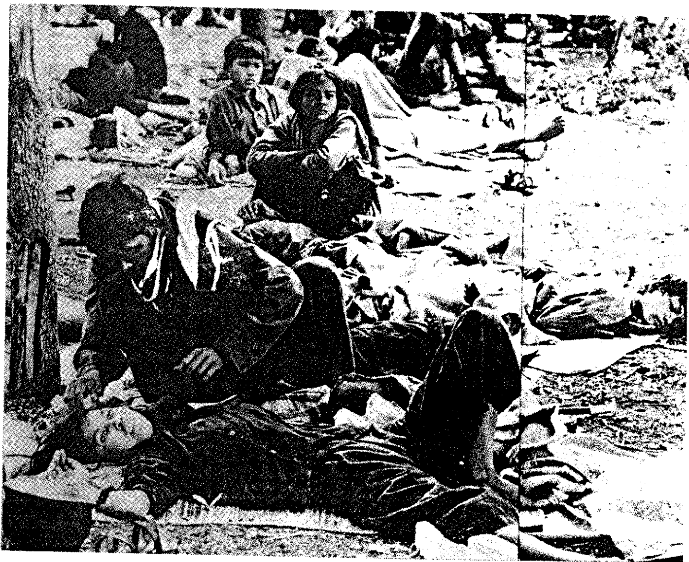
Japanese Photographer TADAO MITOME, in 1980