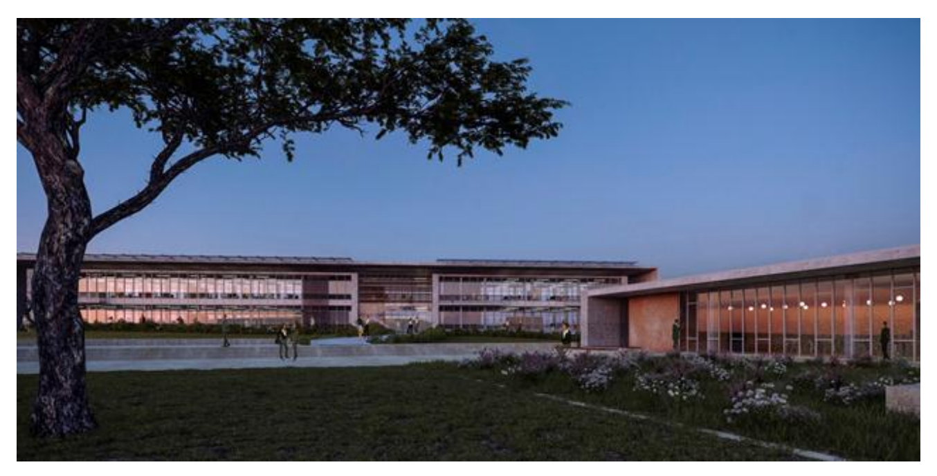
Perspective view of the office and archive buildings looking south-west