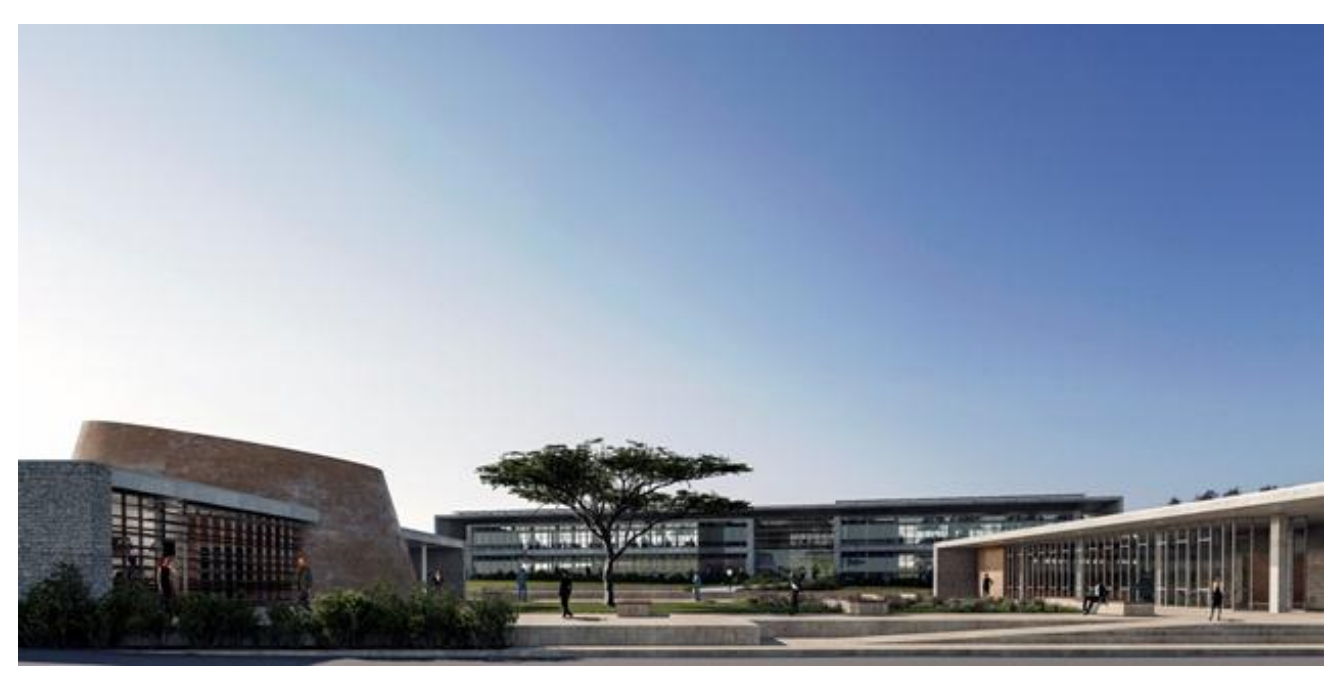
Perspective view of the campus looking south