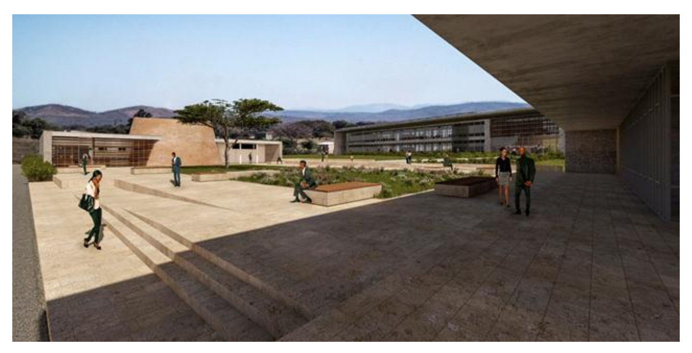
Perspective view of the court building and the office building looking south-east from the archive building