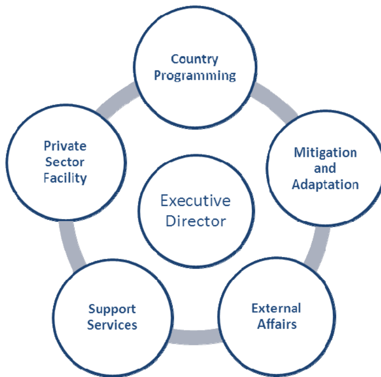
Figure 1. Initial structure of the Secretariat