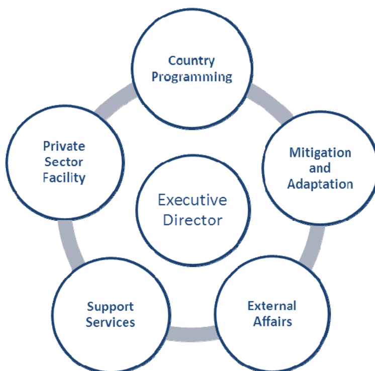
Figure 1. Initial structure of the Secretariat