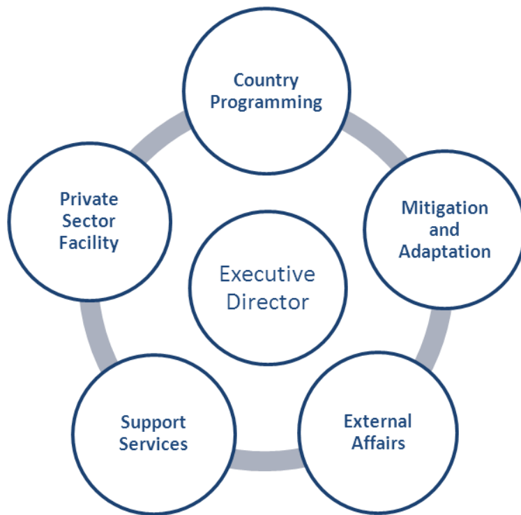
Figure 1. Initial structure of the Secretariat