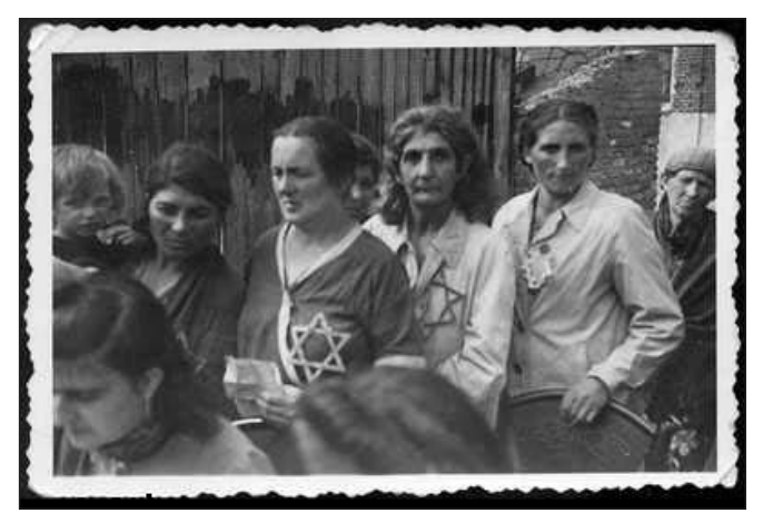
Wloclawek ghetto in Poland.

Under Nazi domination, women sometimes benefited from the stereotypes perpetuated by Nazi ideology, which relegated women to the spheres of child rearing, the home, and religion. The still existent stereotype of the passive, homebound wife dominated by her husband sometimes prevented Nazis from immediately suspecting women of "subversive" activities that did not fit this stereotype. In addition, Jewish women often had more contact with non-Jewish neighbors and were therefore slightly more familiar with Christian mores, which facilitated their assuming a false identity. For these reasons, and others, women were able to resist the Nazis in different ways than Jewish women wear a handmade star of David badge in the men, both spiritually and physically.