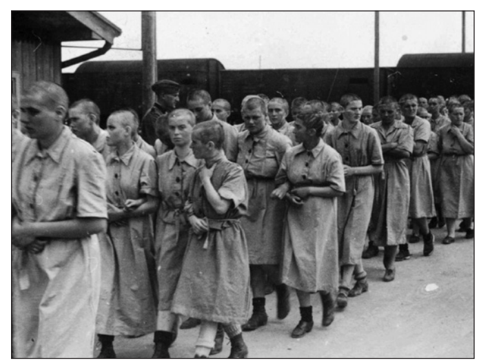
Upon selection for forced labour at Auschwitz Birkenau, the women suffered further humiliation by having their heads shaved.

The continued deterioration in the women's living conditions, the escape eastward of men in conquered Poland, their random recruitment to forced labour – and thus their fear to go out into the street – caused an expansion in the women's sphere of op-