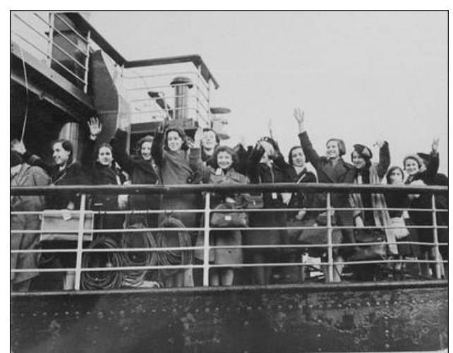
Jewish refugee children from Germany prepare to sail for Harwich, England.

Some had performed such tasks before the Holocaust as well, but many others utilized the skills they had acquired as housewives and extended them to community activity. Women managed soup kitchens, ran children's homes, and built networks for care of the elderly. They served as teachers and caregivers for children whose parents had been deported or mobilized for forced labour.