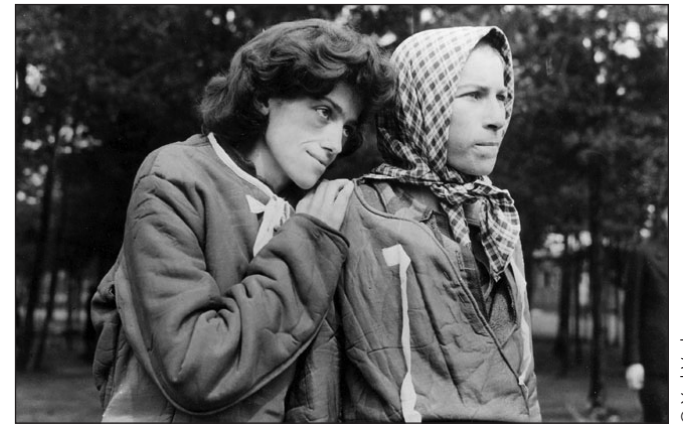
After the war's end, Bergen Belsen became the largest Displaced Persons (DP) camp in Europe, with 10,000 inhabitants in 1946.

Most rescuers were ordinary people. Some acted out of political, ideological or religious convictions; others were not idealists, but merely human beings who cared about the people around them. In many cases they never planned to become rescuers and