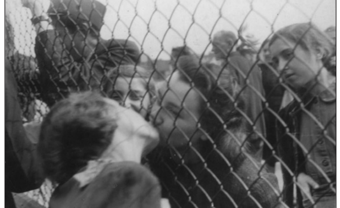
Two women say goodbye as Jews are rounded up before deportation in Lodz, Poland.

Roma and Sinti were murdered by the Nazis in large numbers. Estimates range from 200,000 to over 500,000 victims. Nazi policy toward Roma and Sinti was inconsistent. In Greater Germany, Roma and Sinti who had integrated into society were seen as socially dangerous and eventually were murdered, whereas in the occupied Soviet Union, Roma and Sinti who had integrated into society were not persecuted, but these who retained a normadic lifestyle were put to do