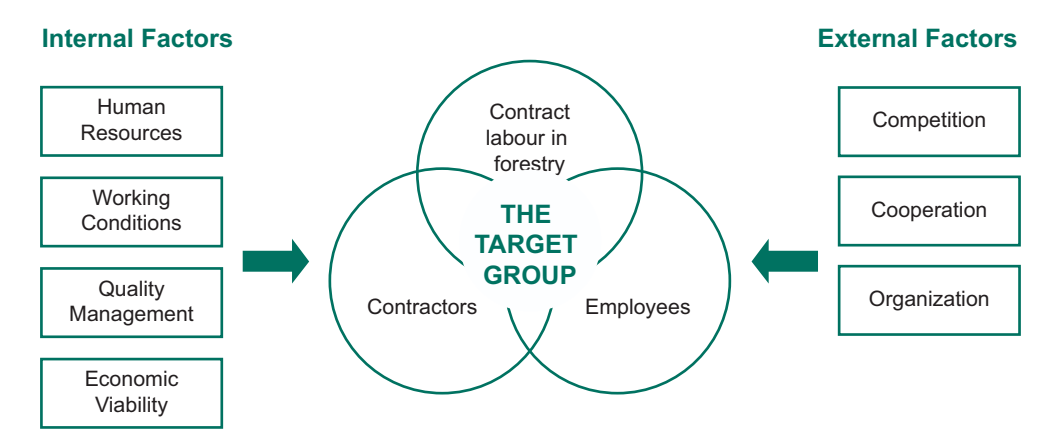
Figure 1. Schematic view of the structure of Part C of the guidelines for best practice