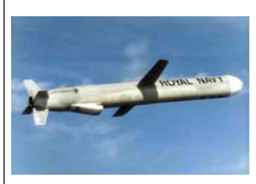
Tomahawk Land Attack Missile

Box 5-1: Comparison of Cruise and Ballistic Missiles