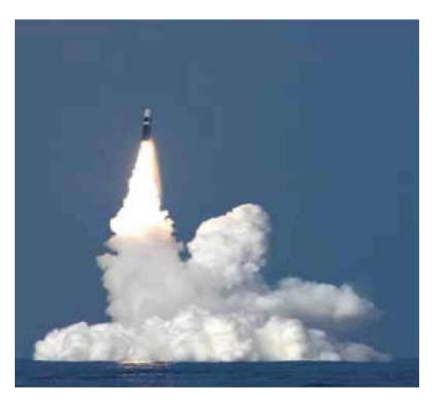
HMS VANGUARD test fires a Trident D5 missile in October 2005