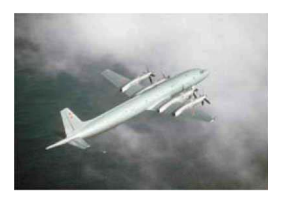
A Russian II-38 May Maritime Patrol Aircraft

We have assessed carefully the potential for future developments in antisubmarine warfare to compromise this position. We believe it is unlikely there will be any radical technological breakthrough which might diminish materially the current advantages of the submarine over potential anti-submarine systems. Over the life of a new class of SSBNs, it is conceivable that unforeseen new technologies could emerge that could enhance the ability of a potential adversary to use air-, sea- or space-based systems to monitor submarine movements. However, even in this eventuality, provided we continue to invest in suitable research and development on effective countermeasures, we believe that it is likely to be possible to use a combination of new technology and new tactics to ensure that the risks to the SSBN on patrol remain manageable. In any event, we judge that a submarine will remain by far the least vulnerable of all the platform options considered.