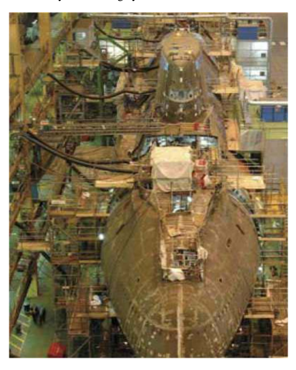
HMS ASTUTe under construction at BAe Systems Submarines, Barrow-in-Furness

61 Designing and building new ISBNs, and integrating them with other elements of the overall system, will be a significant technical challenge for the Ministry of Defence and for industry. Nuclear powered submarines carrying ballistic missiles represent, in engineering terms, one of the most complex and technically demanding systems in existence.