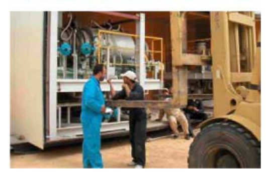
Dismantling the Libyan nuclear programme