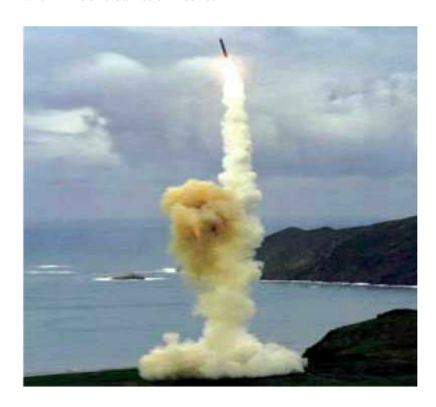
Test firing a Minuteman III missile

A land-based (silo) system equipped with Trident ballistic missiles