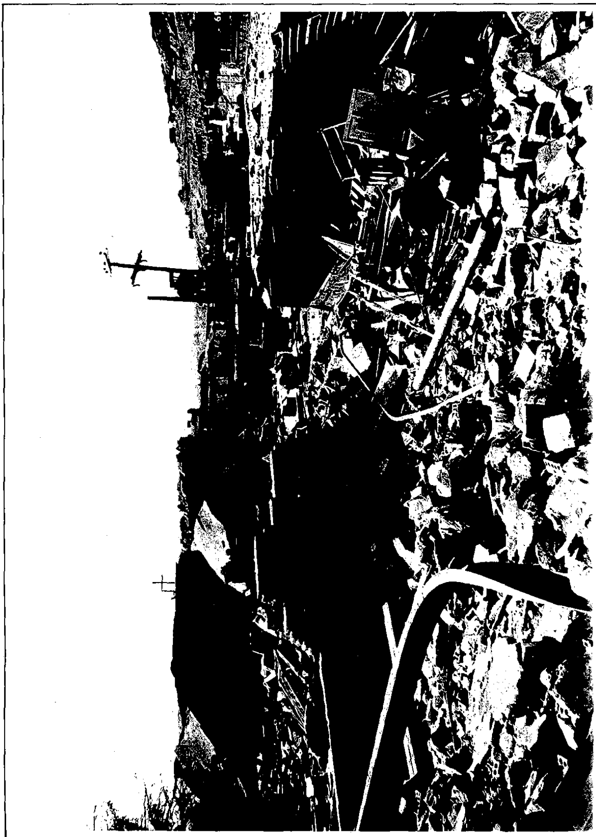
War Information HQ, Supreme Defence Council

MASJID SOLEIMAN, OCTOBER 23, 1983 - The civilian areas of the Iranian city of Masjid Soleiman, 120 kms east of the Iraqi border, was attacked by three Soviet-made missiles on October 22, martyring 94 people and wounding 140 others. Since the start of the Iraqi imposed war on September 23, 1980, the city have been attacked at least in five other instances, martyring 40 and wounding 134 others.