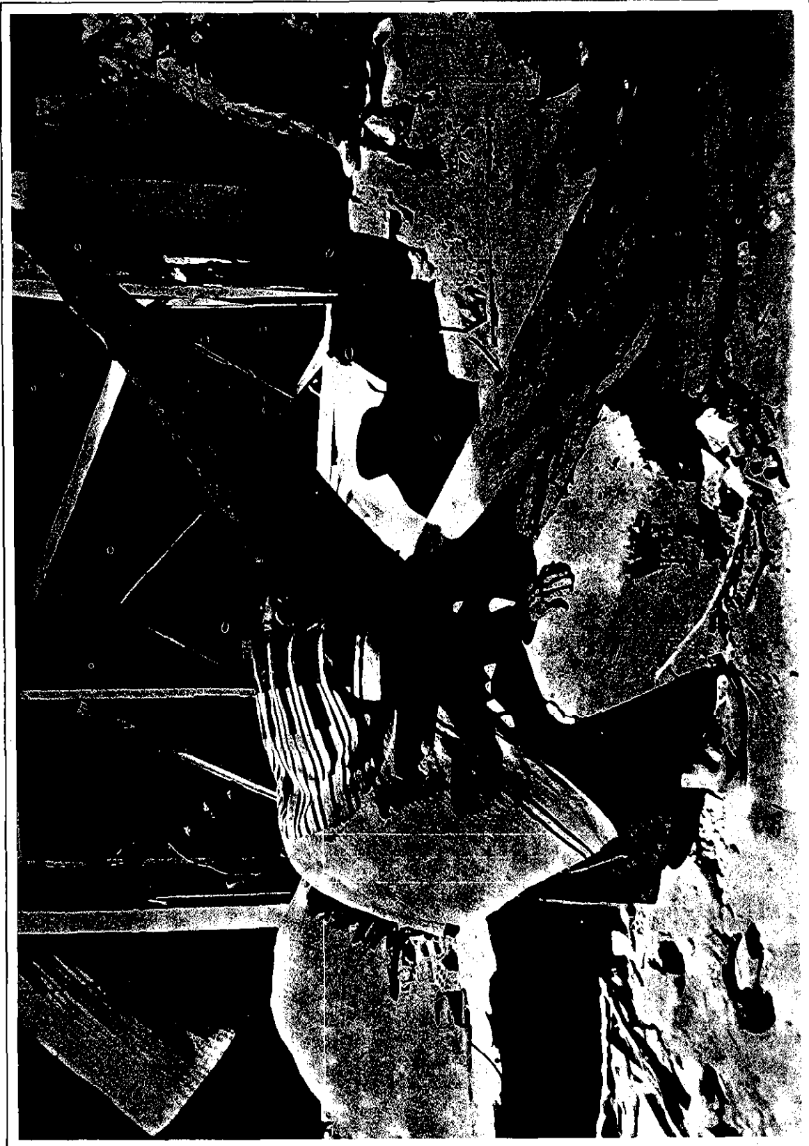
MASJED SOLEIMAN, OCTOBER 23, 1983 - An elderly resident of Masjed Soleiman, in Iran's Khuzestan Province, searches for his belongings after a missile attack by Iraq demolished his home. Three Soviet-made missiles hit the residential quarters here in the afternoon of October 22, martyring 94 people and wounding 140 others.