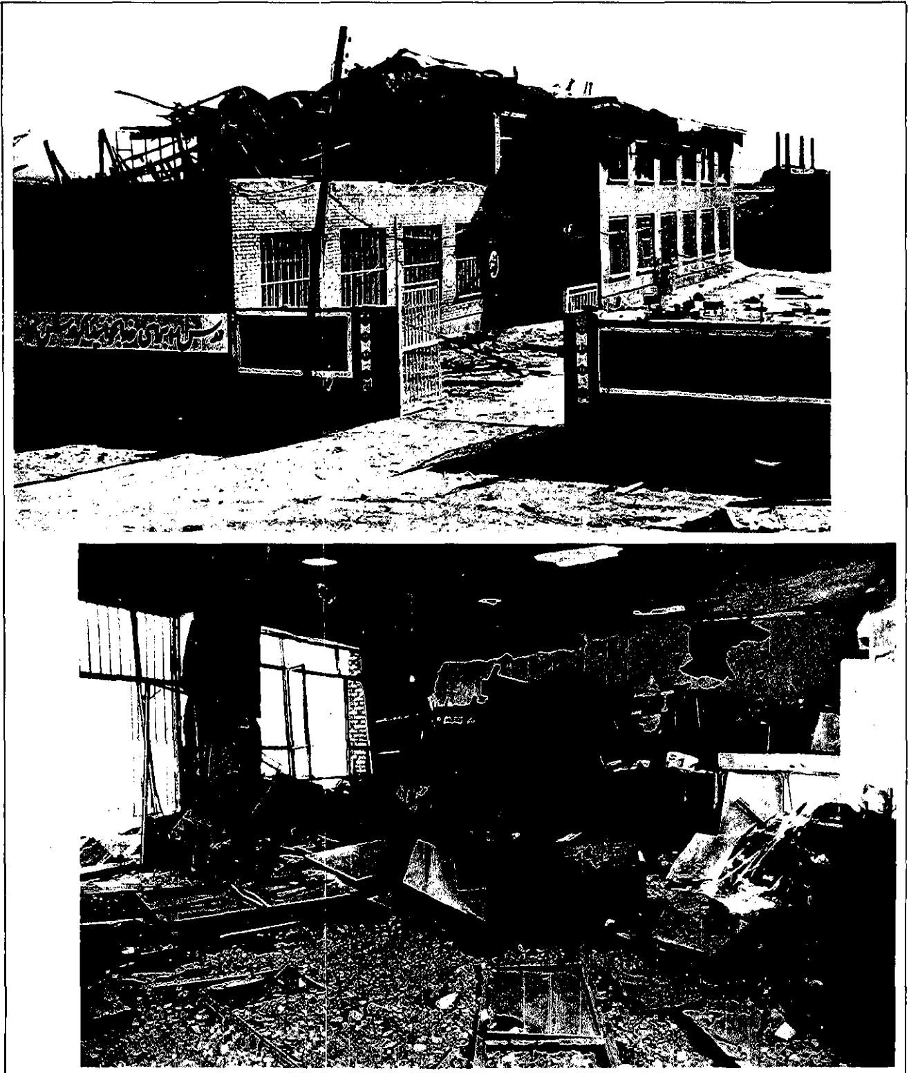
MARIVAN, October 21, 1983.

Three schools and six mosques have been badly damaged in numerous Iraqi artillery attacks and air raids against the Kurdish city of Marivan. The Ayatollah Taleqani High School (seen in these photos) has received the worst damage by the Iraqi attacks. Also three women school teachers from the Shohada Elementary School have been martyred in recent Iraqi bombardments. Educational activity in the city has come to a standstill because of continuous Iraqi attacks since the beginning of the Academic year.