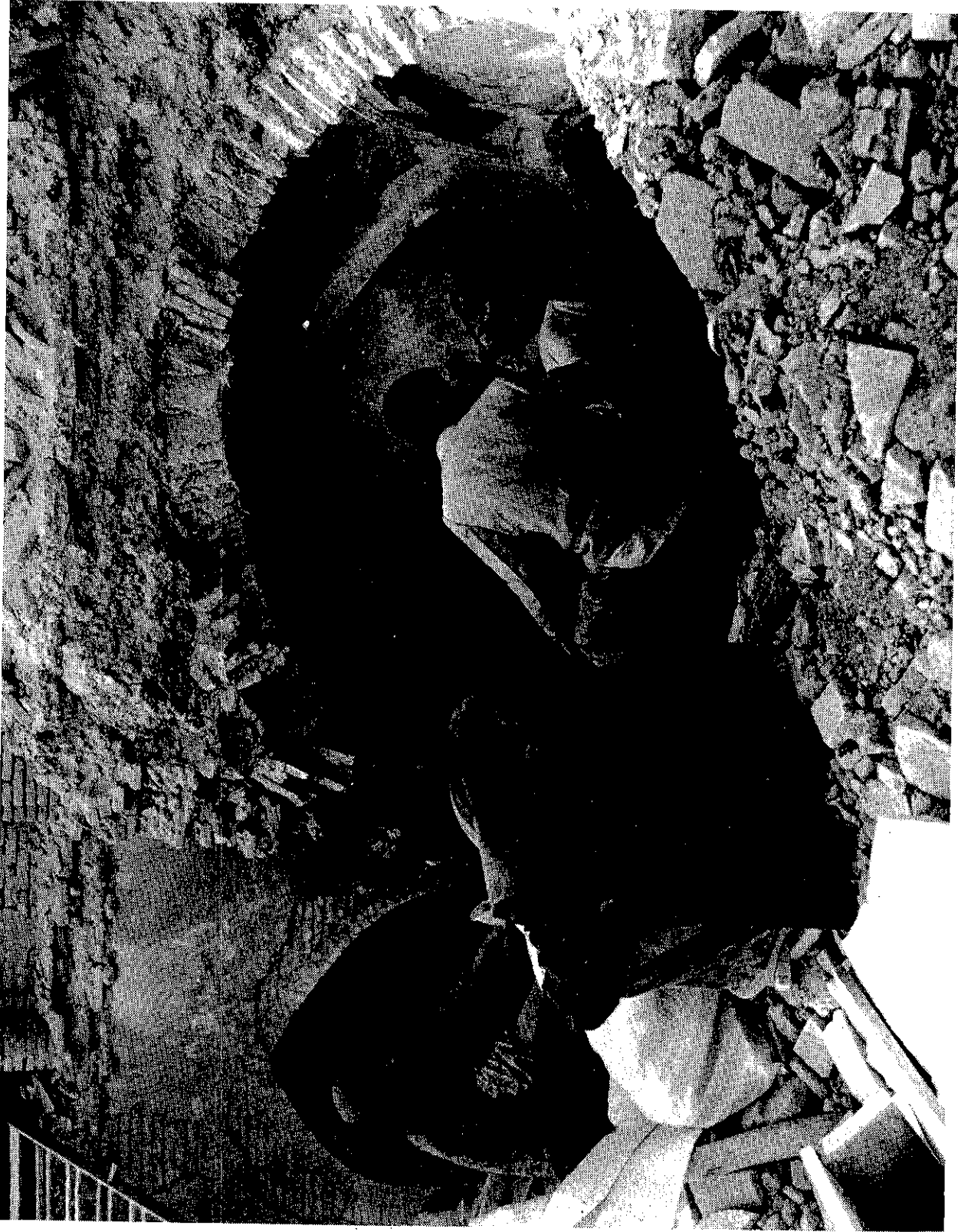
Dezful was the target of the attack of the Iraqi Baathist forces in which a number of people were martyred and wounded on Oct. 23, 1983