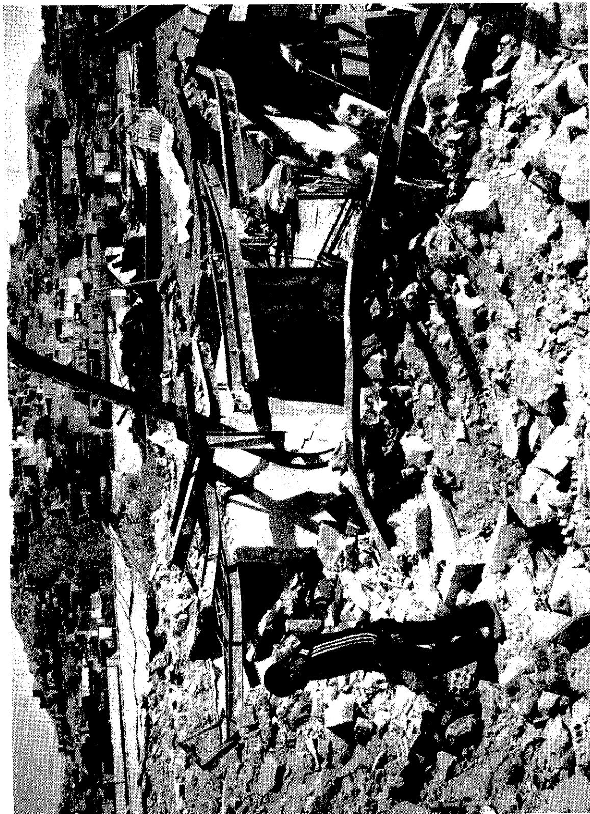
Iraqi forces attacked the city of Behbahan, south Iran, on Oct. 26, 1983, with long-range missiles, when several people were martyred and wounded. The main target was a school in which over 80 students were martyred.