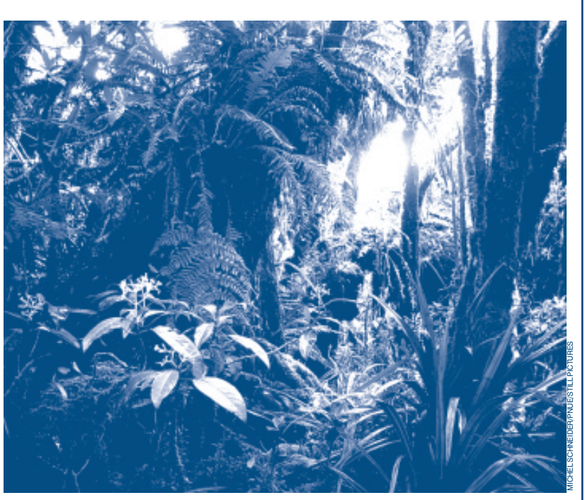
The ITTO is expanding its scope and objectives, but maintaining its niche in tropical forest management.

The first International Tropical Timber Agreement (ITTA) adopted in 1983 was designed to pursue a balance between developmental and environmental objectives. The ITTO has since extended its membership, its