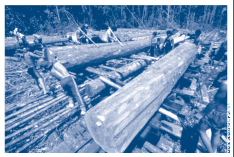
Deforestation, which is bound to continue, is a threat to environmental stability, leads to social inequality and conflicts, and is an inefficent use of resources.

GEN roundtables are held four to six times a year. Past topics have ranged from biosafety and climate change, to international environmental governance and the environmental impacts of war.