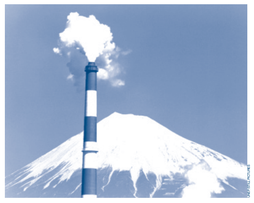
Environmental targets are included explicitly in multi-lateral environmental agreements, including the climate change convention.

Despite the growing number of treaties, environmental degradation continues at an alarming pace. There is a need to create policy tools to arrest this trend. Common goals can help governments to formulate the framework for their cooperative action.