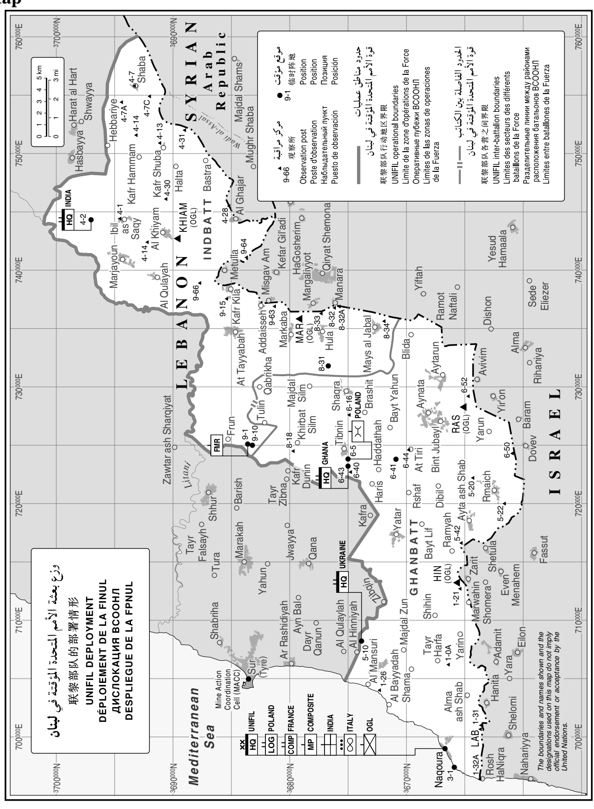
Map No. 4144 Rev. 13 UNITED NATIONS January 2006

Department of Peacekeeping Operations Cartographic Sectior