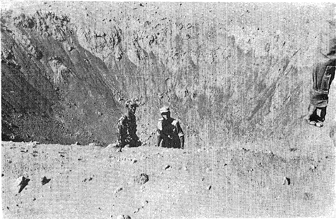
This crater, 12 metres deep, was dug by a 500-kg bomb thrown over Mapai airport runway by a Mirage plane.