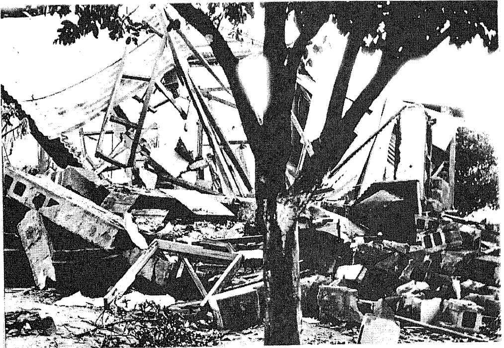
This pile of debris and bricks used to be the building where the Post Office was functioning.