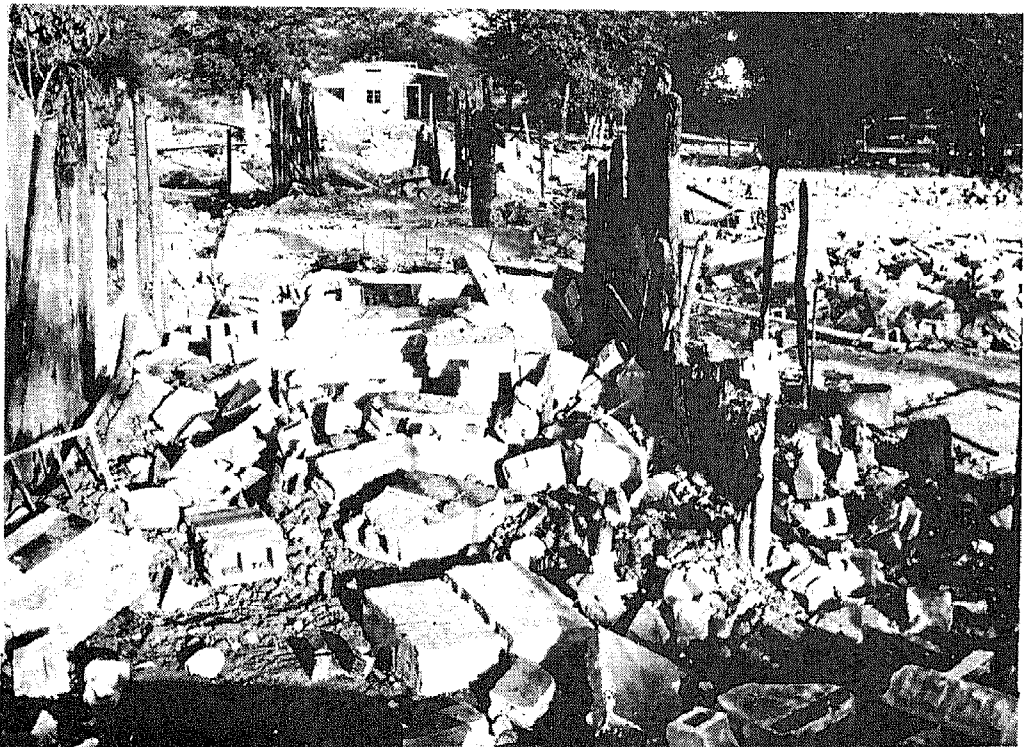
The town of Mapai was totally destroyed by the Rhodesian troops.