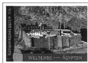
€ 0,75 Saint Catherine area