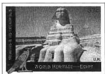
37-cent - Memphis and its necropolis – the pyramid fields from Giza to Dahsur