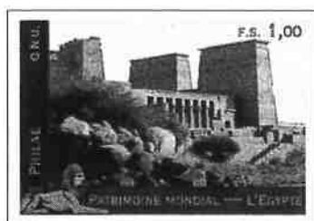
CHF 1,00 Nubian monuments from Abu Simbel to Philae