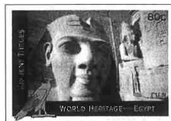
80 cent –Ancient Thebes with its necropolis