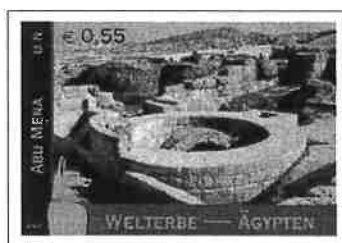
€ 0,55 - Abu Mena