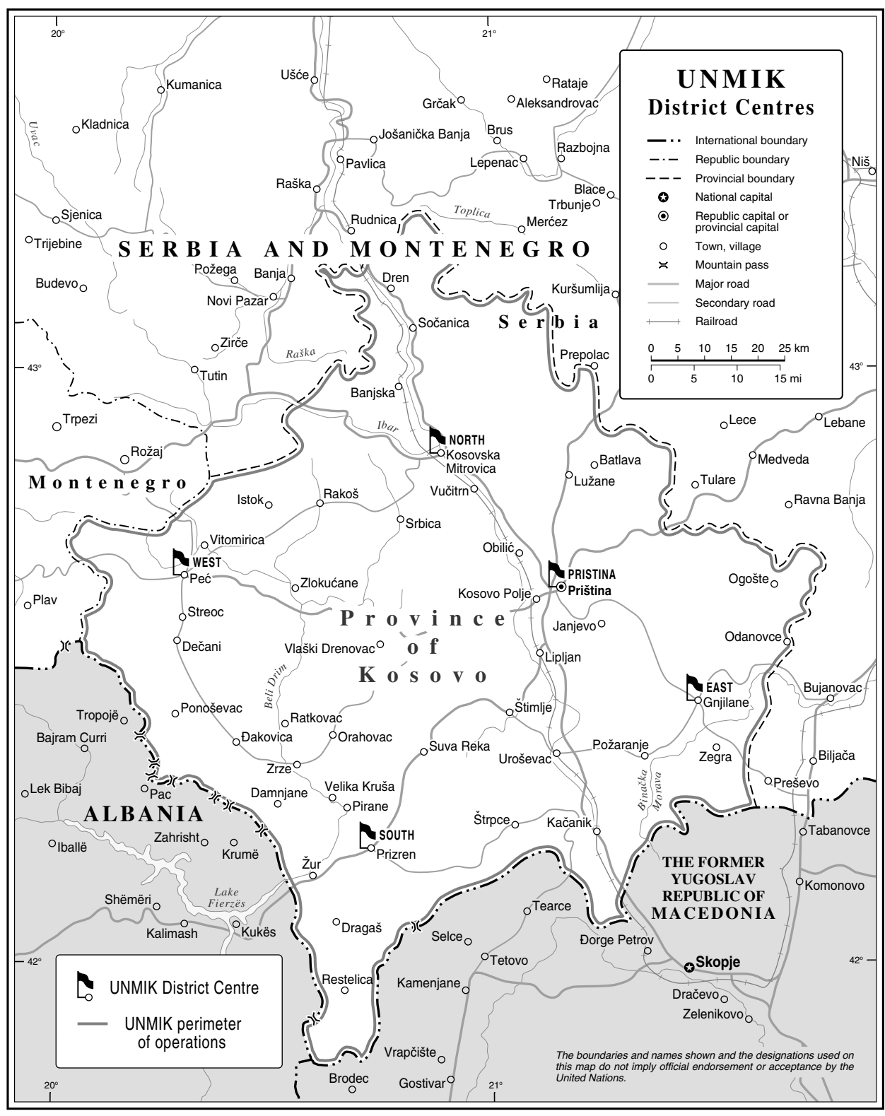
Map No. 4133 Rev. 17 UNITED NATIONS October 2004