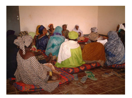
A women session in progress in Menaka