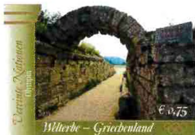
Olympia -€ 0.75 stamp