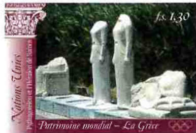
Pythagoreion and Heraion of Samos CHF 1.30 stamp