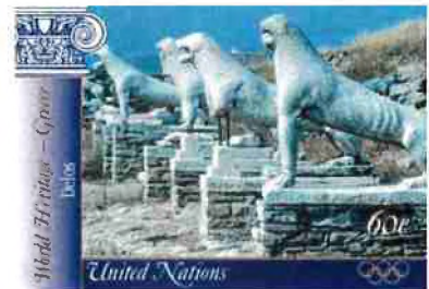
Delos - US$ 0.60 stamp