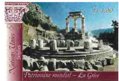
Delphi - CHF 1.00 stamp