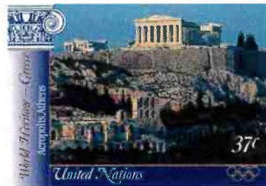
Acropolis, Athens - US$ 0.37 stamp