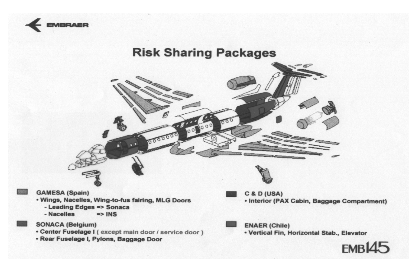
Figure 1 – Division of Labour between Embraer and its Risk Partners for the ERJ-145/140/135