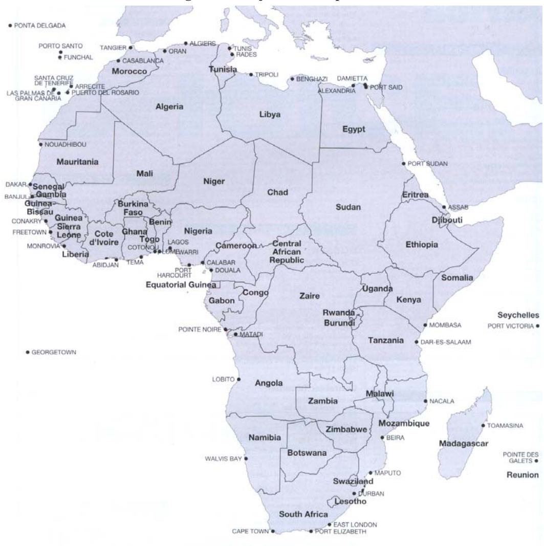
Figure 1: Major African ports