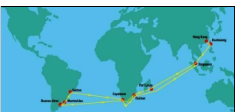
Illustration 7 ROUTE OF EVERGREEN'S REGULAR LINER SHIPPING SERVICE BETWEEN SOUTH AMERICA'S EAST COAST AND THE FAR EAST

Most services that directly link South America's east coast with Africa are part of longer routes which connect points further east with the Asia Pacific region. The following illustration shows one such service.