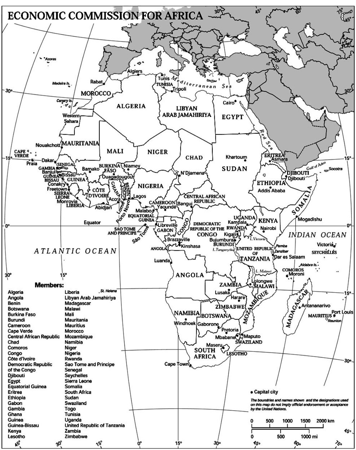
Illustration 1 MAP OF AFRICA