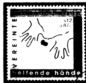
Ikko Tanaka (Japan)