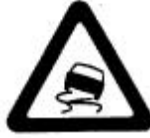
A, 9 [A,8]