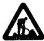
A, 16 [A,15]