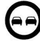
C, 13 aa