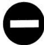
C, 1 a