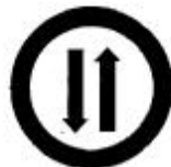
A, 23 [B, 5]