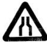
A, 4 a