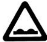
A, 7 a