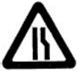
A, 4 b