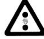
A, 17 a [A, 16 a ]