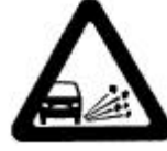
A, 10 a [A, 9 a ]