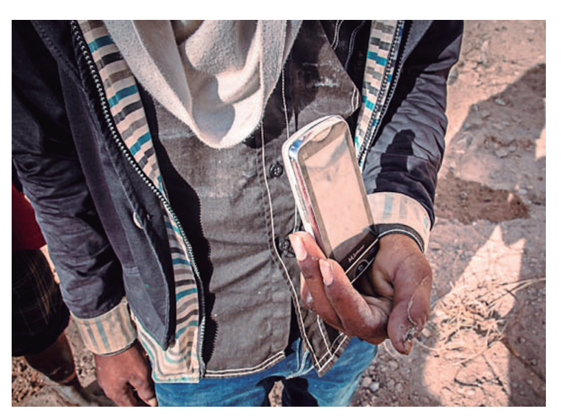
Photo: "Migrant worker, Thailand", Maryann Bylander/CC BY-NC-ND 3.0 IGO - Thailand, 2012

Today's world is experiencing an unprecedented level of population movement. The United Nations General Assembly recently reported in their New York Declaration for Refugees and Migrants that the number of migrants in 2015 surpassed 244 million, roughly 65 million of which were forcibly displaced. These migrants often face unique dangers and difficulties, both in relation to the process of geographical relocation and in relation to their settlement in their new societies of residence.<sup>2</sup> When it comes to settlement, migrants often experience difficulties having to do with feelings of being pulled in different directions. For example, it is common for migrants to experience what Abdelmalek Sayad (2004) has called "dual absence"- the feeling of belonging "neither here nor there".