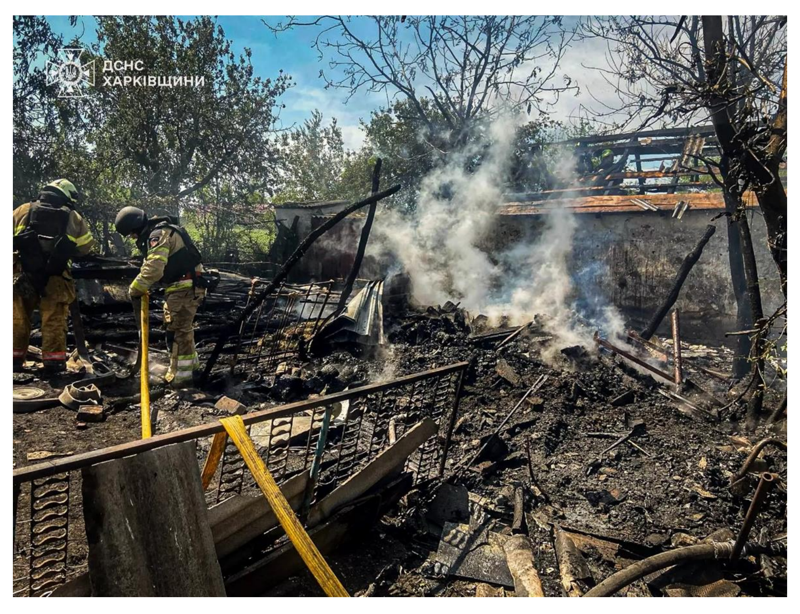
An additional photograph is on file with the Secretariat and available for consultation.

Consequences of Russia's attack on civilians in the Izium raion of the Kharkiv region (3 June 2025)