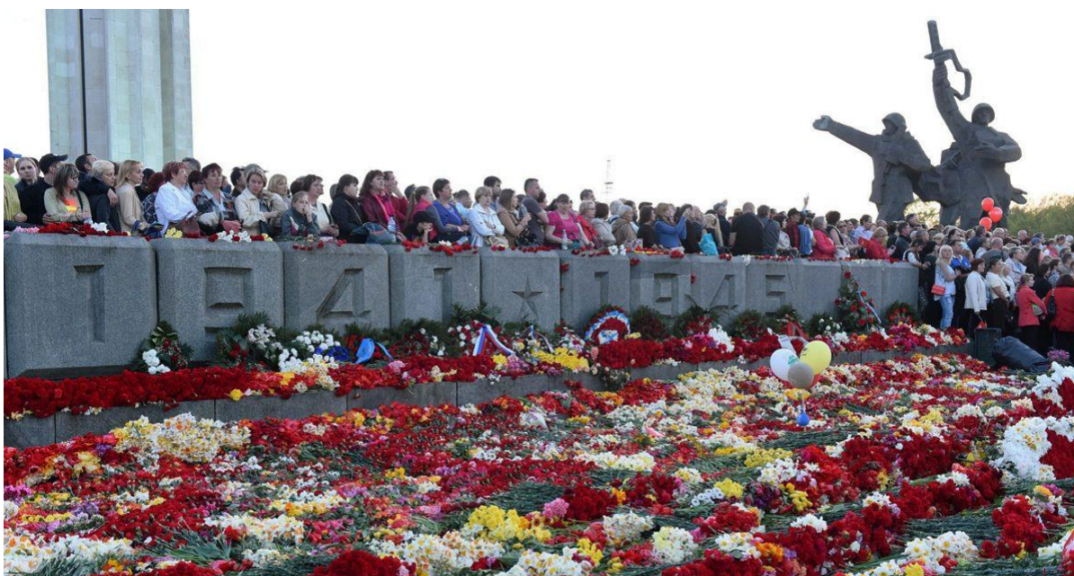
Victory Day celebrations in Riga in 2021.