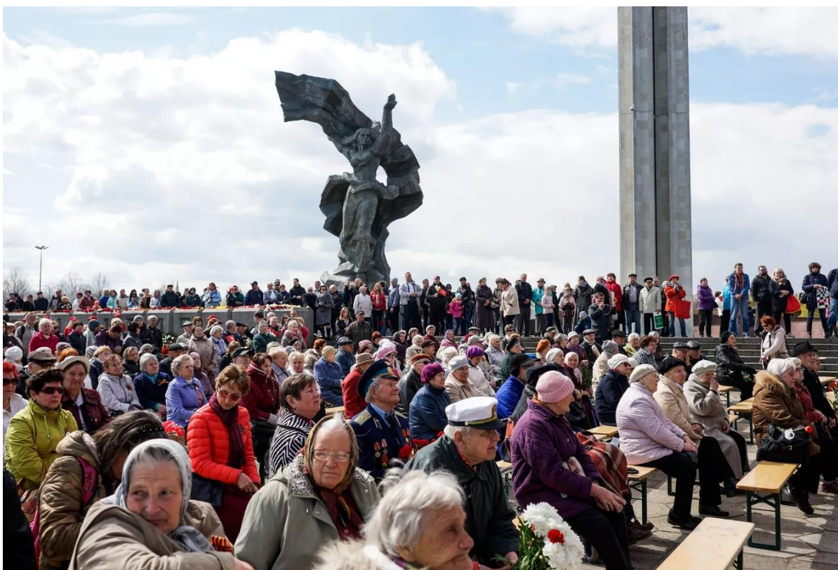
9 May celebrations in Riga in 2018