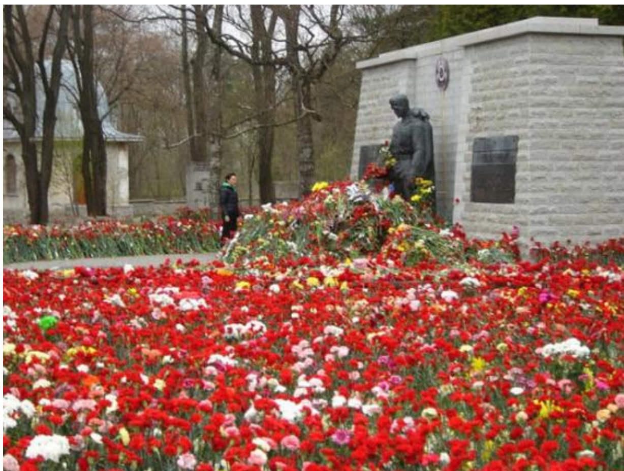
Flowers at The Bronze Soldier monument in honour of 9 May

Russian compatriots were widely outraged by the desecration of this monument on 22 June 2019, when unidentified persons pinned a leaflet depicting a skull on the monument. The Estonian police brought no perpetrators to justice, winding the incident down and referring to the "poor quality of surveillance camera footage".