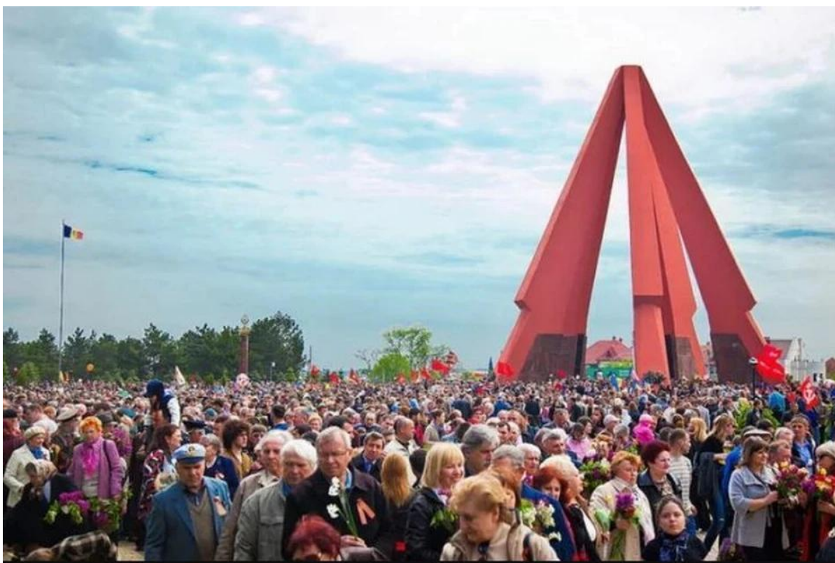
Victory Day celebration in Moldova.

Since 2022, Moldova has started imposing restrictions on holding events on the occasion of 9 May and other dates commemorating the Great Patriotic War, despite the country's traditional widespread celebration of this holiday.