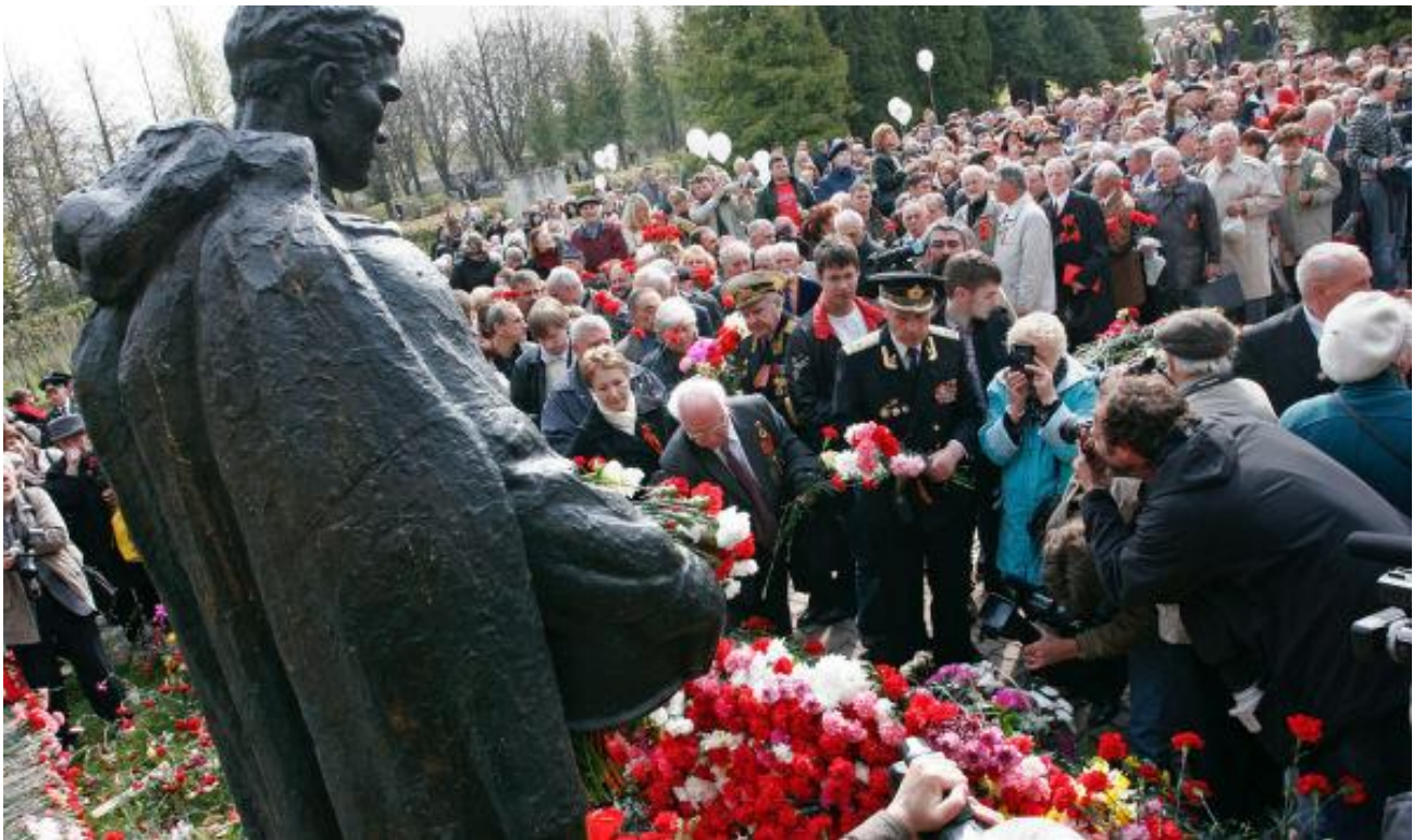
Laying flowers at The Bronze Soldier on a Victory Day anniversary

Despite relocation, the memorial retained its central role in Victory Day celebrations. Every 9 May (the day the Great Patriotic War ended), tens of thousands of Tallinners gathered at The Bronze Soldier to commemorate the fallen heroes. Moreover, Estonian Defense Forces members also laid a commemorative wreath at the monument with their commanders' assent. However, the memorial still continued to be attacked by vandals.