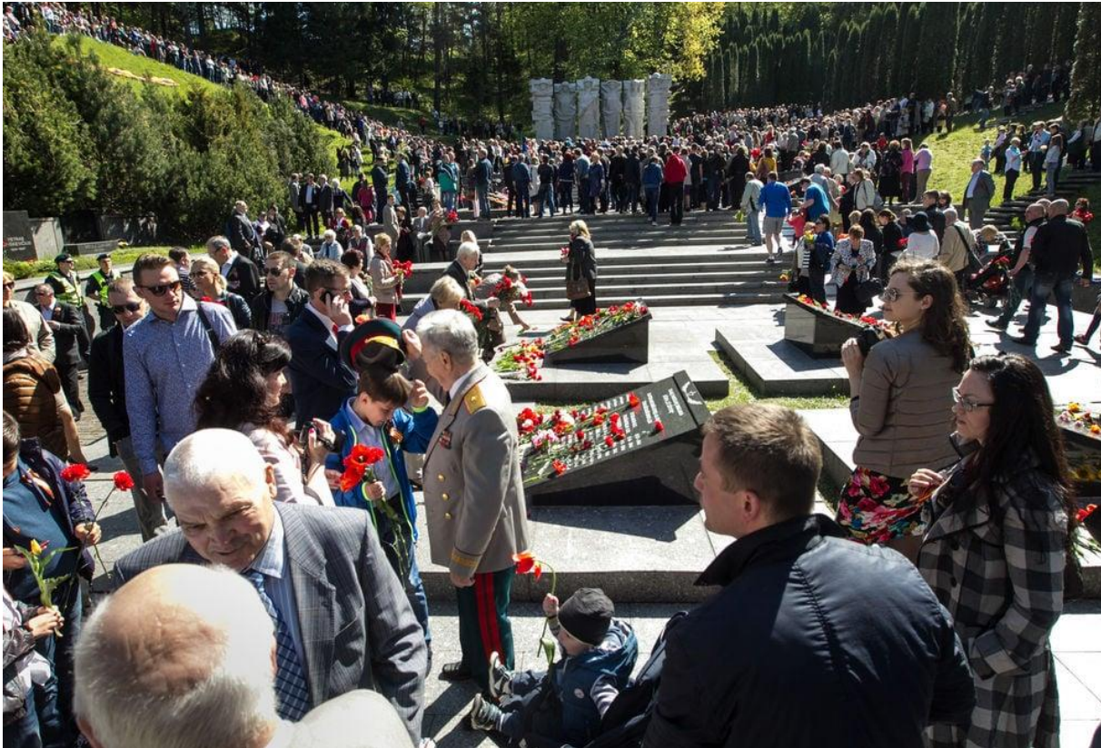
Flower-laying at the Antakalnis Cemetery in Vilnius. 9 May 2015.