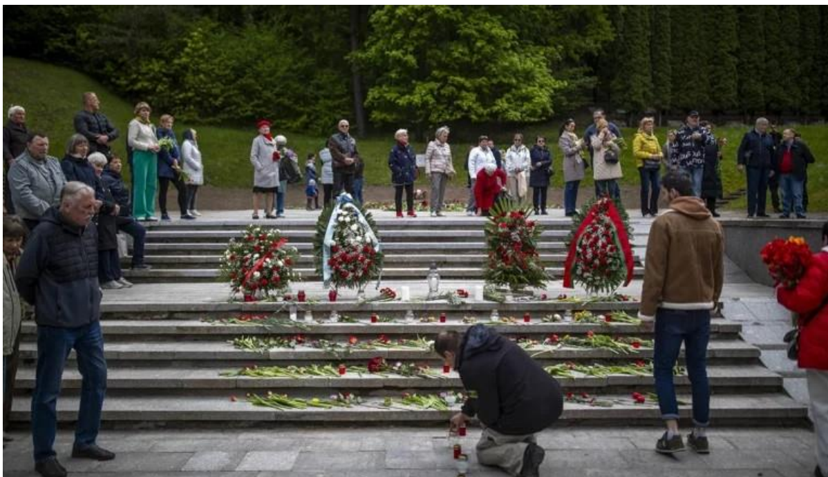
People are laying flowers at the Antakalnis Cemetery after the demolition of the steles.