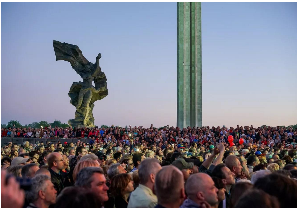
City square near the Monument to Liberators in Riga on 9 May 2022.