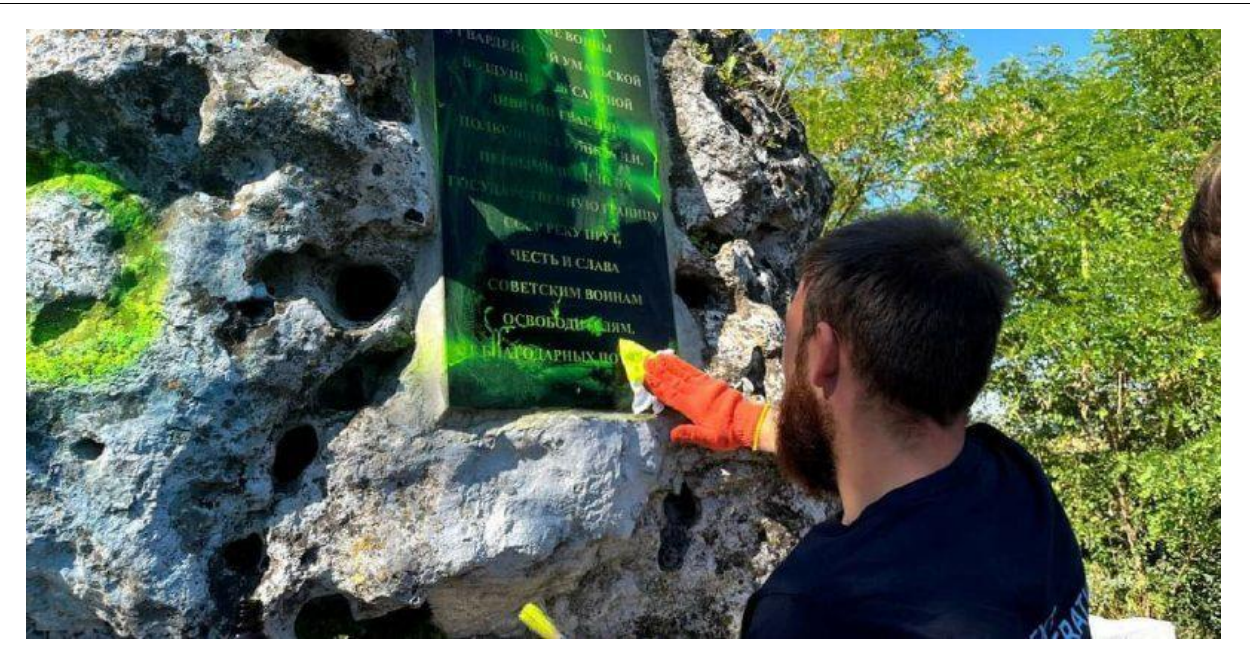
Activists clean the monument to Soviet soldiers.

On the night of 11 September 2023, a monument commemorating the heroic deeds of the Soviet liberators of the Sixth Tank Army in Cornesti, Ungheni district, was desecrated by unidentified vandals. Insulting inscriptions were written on the pedestal of the commemorative T-34 tank, erected in honour of the soldiers of the Sixth Tank Army who were the first to reach the border area of the USSR in March 1944.<sup>84</sup> Volunteers from Balti joined in with the clean-up of the monument.<sup>85</sup> Russia's Investigative Committee launched an investigation into the desecration.<sup>86</sup>