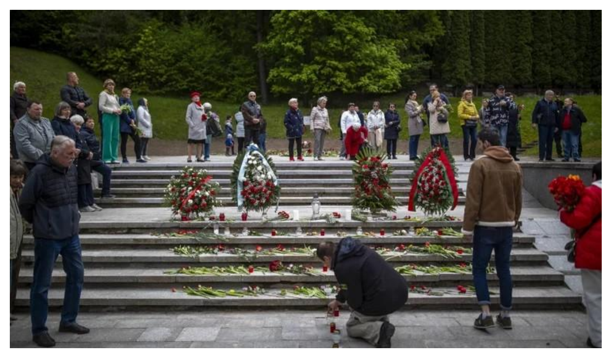
People are laying flowers at the Antakalnis Cemetery after the demolition of the steles.

The Russian authorities are taking measures to identify and bring to justice those responsible for these sacrilegious acts. The Investigative Committee of the Russian Federation is investigating the destruction of memorials erected in memory of Red Army soldiers who died fighting the Nazis. In September 2023, the agency reported that the investigators have 16 criminal cases under investigation for 143 cases of desecration, destruction or damage to war graves, monuments and memorials to Soviet soldiers. 173 foreign nationals – citizens of Latvia, Lithuania, Estonia, Poland and Ukraine – have been brought as defendants in absentia for committee of the Russian Federation A. Bastrykin instructed to investigate the desecration of the memorial sign to Soviet soldiers in Druskininkai.<sup>63</sup>