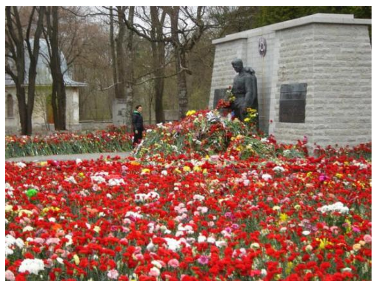
Flowers at The Bronze Soldier monument in honour of 9 May

Russian compatriots were widely outraged by the desecration of this monument on 22 June 2019, when unidentified persons pinned a leaflet depicting a skull on the monument. The Estonian police brought no perpetrators to justice, winding the incident down and referring to the "poor quality of surveillance camera footage".