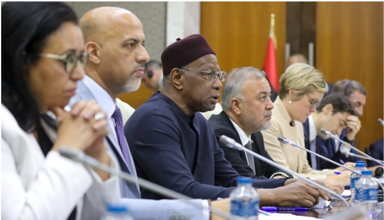
Abdoulaye Bathily (center), Special Representative of the Secretary-General for Libya and Head of UNSMIL, at the co-chairs of the Security Working Group of the Berlin Process International Follow-Up Committee meeting in Tripoli, Libya.