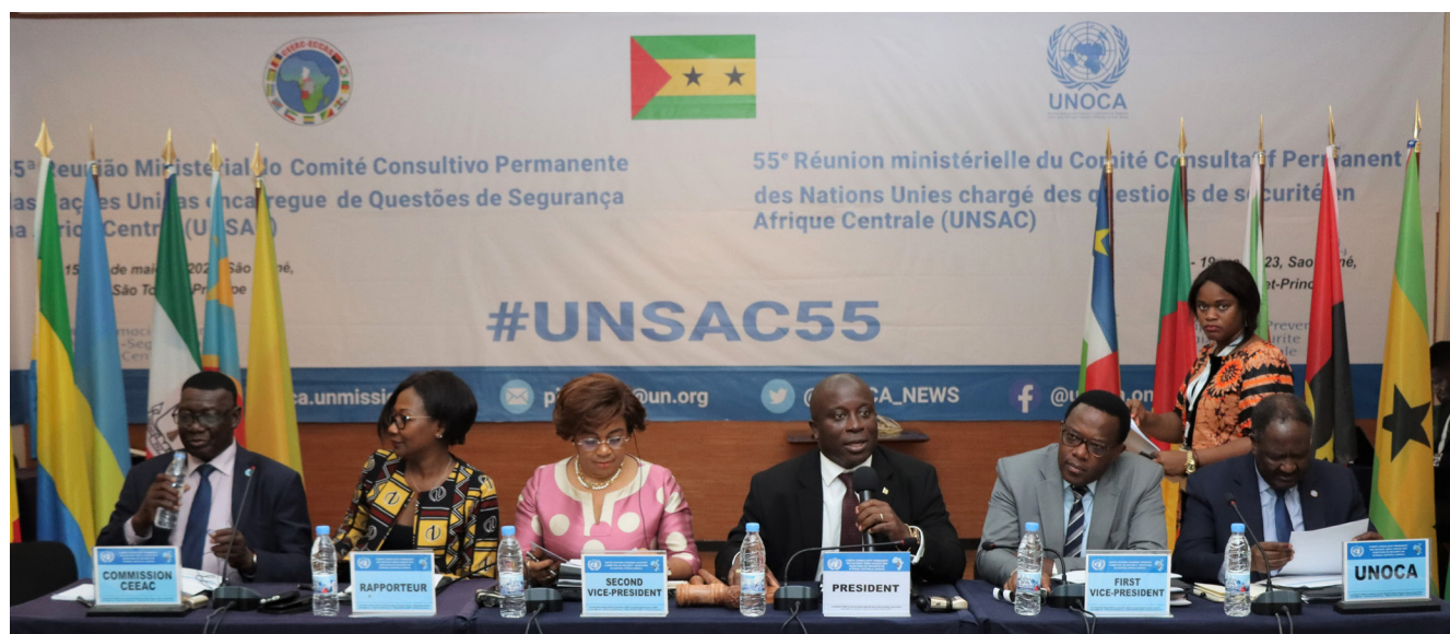
The United Nations Regional Office for Central Africa (UNOCA) serves as the secretariat of the United Nations Standing Advisory Committee on Security Questions in Central Africa.