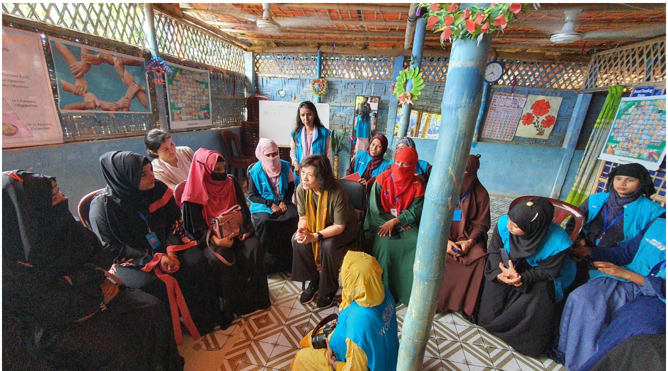
Noeleen Heyzer (center), Special Envoy of the Secretary-General on Myanmar, meets with Rohingya women during her visit to Bangladesh refugee camps.

35. Until the completion of her mandate in June 2023, the Special Envoy of the Secretary-General on Myanmar worked to mobilize the international community and key regional stakeholders to create conditions conducive to the safe, dignified, voluntary and sustainable return of Rohingya refugees. Engaging with key stakeholders in Myanmar, the Special Envoy advocated for pragmatic steps towards a cessation of violence and a return to civilian rule based on the will and needs of the people. The Special Envoy worked in a complementary manner with the Special Envoy of the Chair of the Association of Southeast Asian Nations (ASEAN) to support the implementation of the Association's five-point consensus. On 1 August 2023, the military extended the state of emergency for another six months amidst intensified violence and conflict throughout the country.