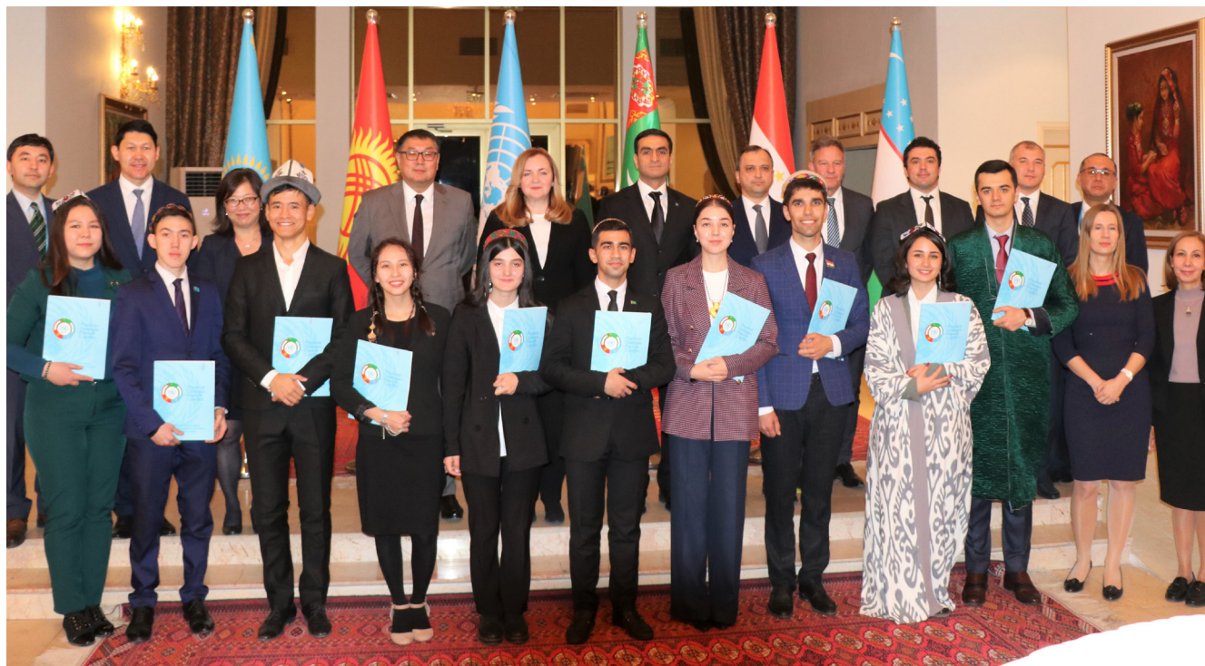
The United Nations Regional Centre for Preventive Diplomacy for Central Asia (UNRCCA) hosts the Fourth Dialogue between the Governments and Youth of Central Asia in Ashgabat, Turkmenistan.