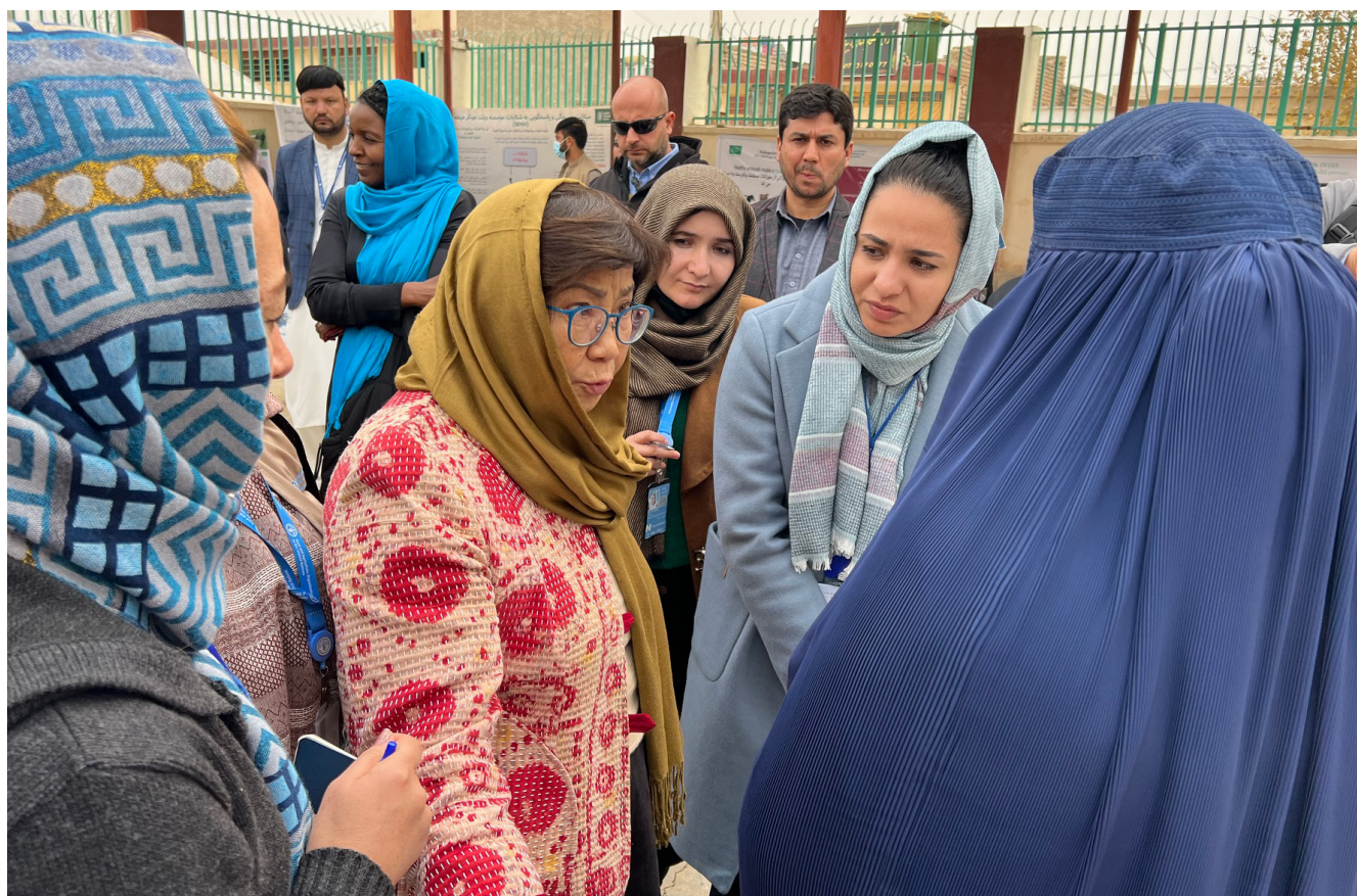
Roza Otunbayeva, Special Representative of the Secretary-General and Head of the United Nations Assistance Mission in Afghanistan (UNAMA), visits a project site in Mazar-i-Sharif and engages in conversation with female beneficiaries.

34. The Security Council, in its resolution 2678 (2023), extended the mandate of the United Nations Assistance Mission in Afghanistan (UNAMA) until 17 March 2024. In resolution 2679 (2023), the Security Council requested the Secretary-General to conduct and provide an integrated, independent assessment no later than 17 November 2023, to offer recommendations for an integrated and coherent approach to address the current challenges faced by Afghanistan. On 5 April, the de facto Minister for Foreign Affairs, Amir Khan Motaqi, verbally notified the Special Representative of the Secretary-General for Afghanistan and Head of the United Nations Assistance Mission in Afghanistan the decision to impose severe restrictions on national female staff working for the United Nations with immediate effect. The United Nations condemned the decision and requested United Nations national personnel – women and men – not to report to United Nations offices, with limited exceptions made for the performance of critical tasks. This posture remains in place for UNAMA and is under constant monitoring. UNAMA continues in all its interactions with the de facto authorities to seek a reversal of the severe restrictions.