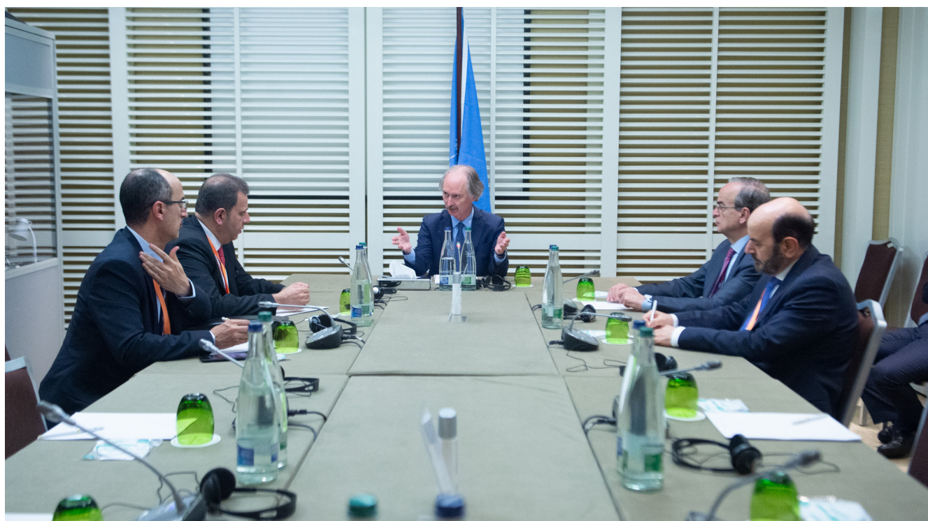
Geir Pedersen (center), Special Envoy of the Secretary-General for Syria, convenes the Syrian Constitutional Committee with the co-chairs in Geneva.