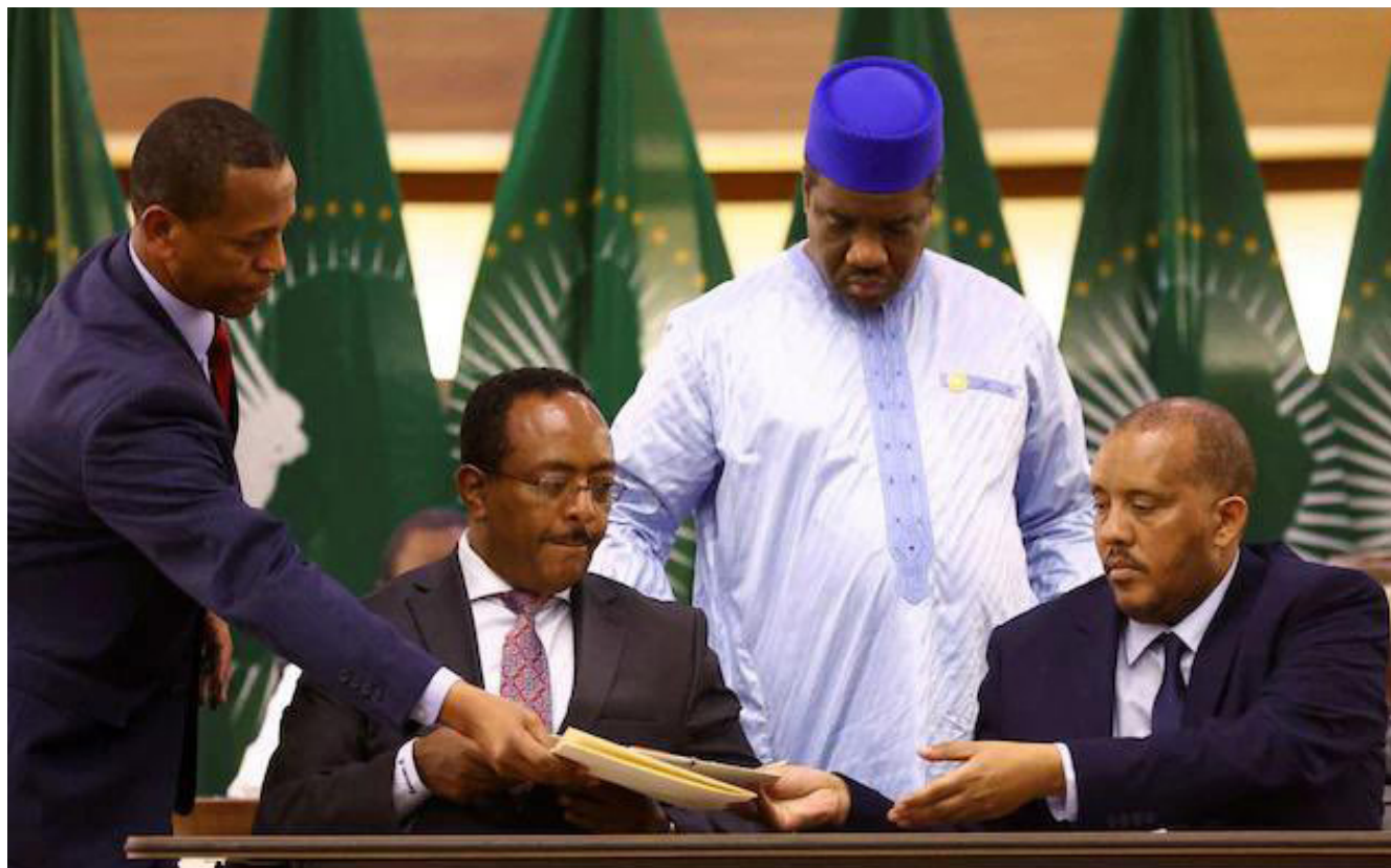
Redwan Hussein Rameto (left) from the Ethiopian government, and Getachew Reda (right), who represents Tigray People's Liberation Front (TPLF) sign the Agreement for Lasting Peace through a Permanent Cessation of Hostilities (CoHA) on 2 November 2022 in Pretoria, South Africa.