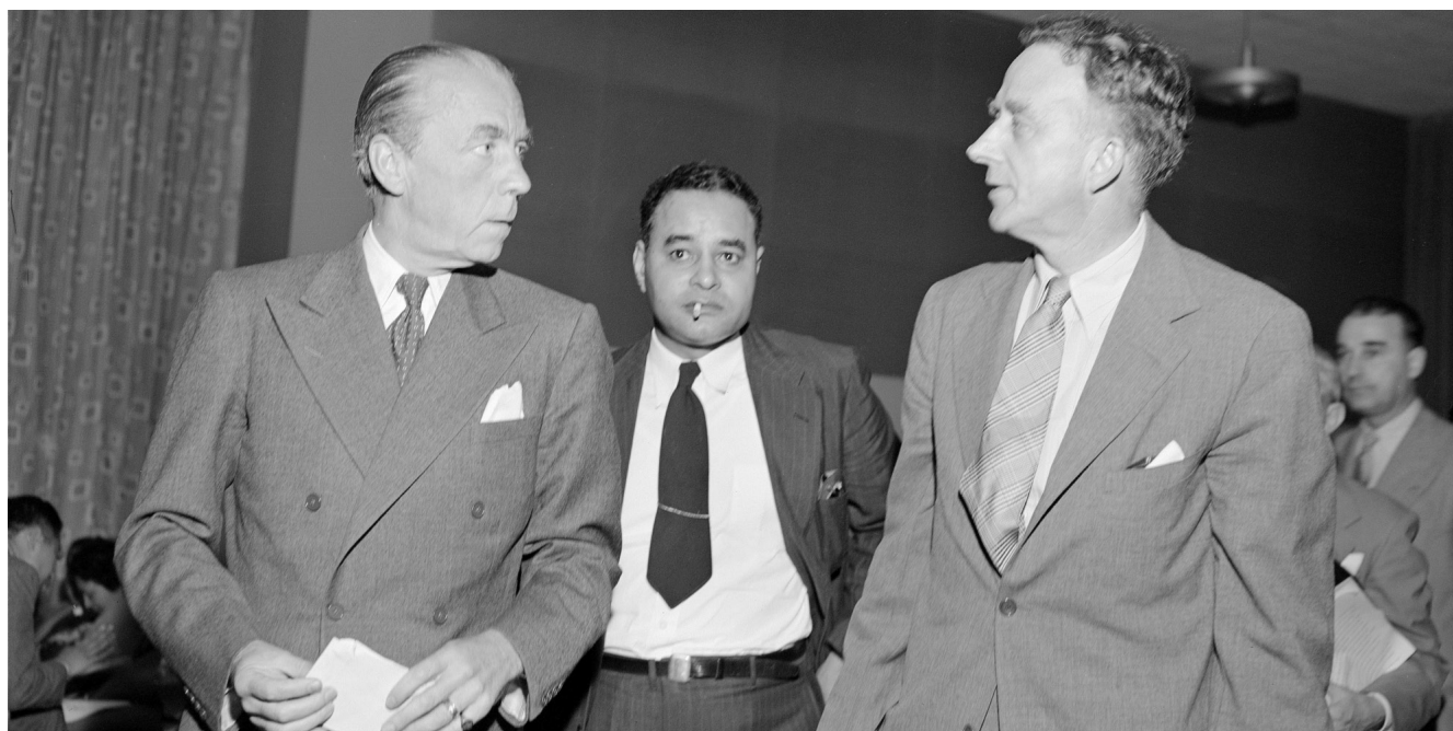
Folke Bernadotte (left), United Nations Palestine Mediator, Ralph Bunche (center), Principal Secretary of UN Palestine Commission and representative of the Secretary-General, and Philip C. Jessup (right), Assistant on Judicial Organization of the United States, arrive at the Security Council meeting on Palestine.