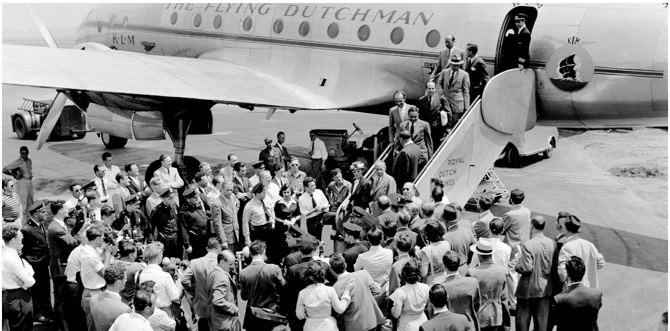
Trygve Lie, Secretary-General of the United Nations, greets Count Folke Bernadotte, United Nations Palestine Mediator, and spouse Estelle Manville-Bernadotte, upon their arrival at La Guardia Airport.