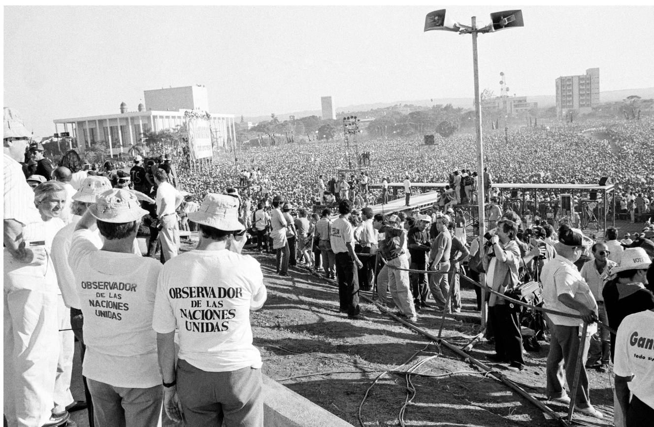
The United Nations Observer Mission in Nicaragua monitor a political rally in Managua.

8. The end of the cold war presented new opportunities for collective security and special political missions. The political transitions witnessed in many parts of the world resulted in increased requests from Member States for United Nations assistance, in particular in areas such as mediation and the provision of good offices in support of regional efforts to restore constitutional order following unconstitutional changes of government; electoral support; constitution-making; reconciliation; and the rule of law. In response, the United Nations established new missions in Asia, Africa and Central America to help Member States address those needs. For instance, in 1993, at the request of the General Assembly, the Secretary-General dispatched a Special Mission to Afghanistan with a mandate to canvass a broad spectrum of the leaders of Afghanistan to solicit their views on how the United Nations could best assist Afghanistan in facilitating national rapprochement and reconstruction. 3 United Nations political offices were established in Burundi in 1993 and Somalia in 1995 to advance peace and reconciliation in these countries. Electoral support was also a central focus of some of the political missions mandated during the late 1980s and 1990s, such as the United Nations Observer Mission to Verify the Electoral Process in Nicaragua and the United Nations Observer Group for the Verification of Elections in Haiti.