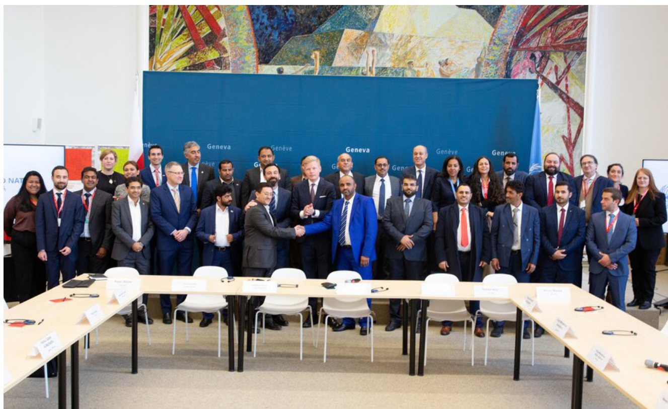
Hans Grundberg (center), Special Envoy of the Secretary-General for Yemen, congratulates as the parties to the conflict in Yemen finalize the implementation plan for the release of 887 conflict-related detainees.

43. The Special Envoy of the Secretary-General for Yemen engaged with a range of Yemeni stakeholders, with the aim of launching an inclusive, multitrack political process to end the conflict. Despite the expiration in October 2022 of the truce brokered by the United Nations, levels of violence remained at their lowest since the onset of the conflict in 2015. Many elements of the truce continued to benefit the population, in particular the entry of fuel and goods into Hudaydah ports and commercial flights from Sana'a airport. There have been neither Houthi cross-border attacks on neighbouring countries nor Saudi-led coalition air strikes in Yemen.