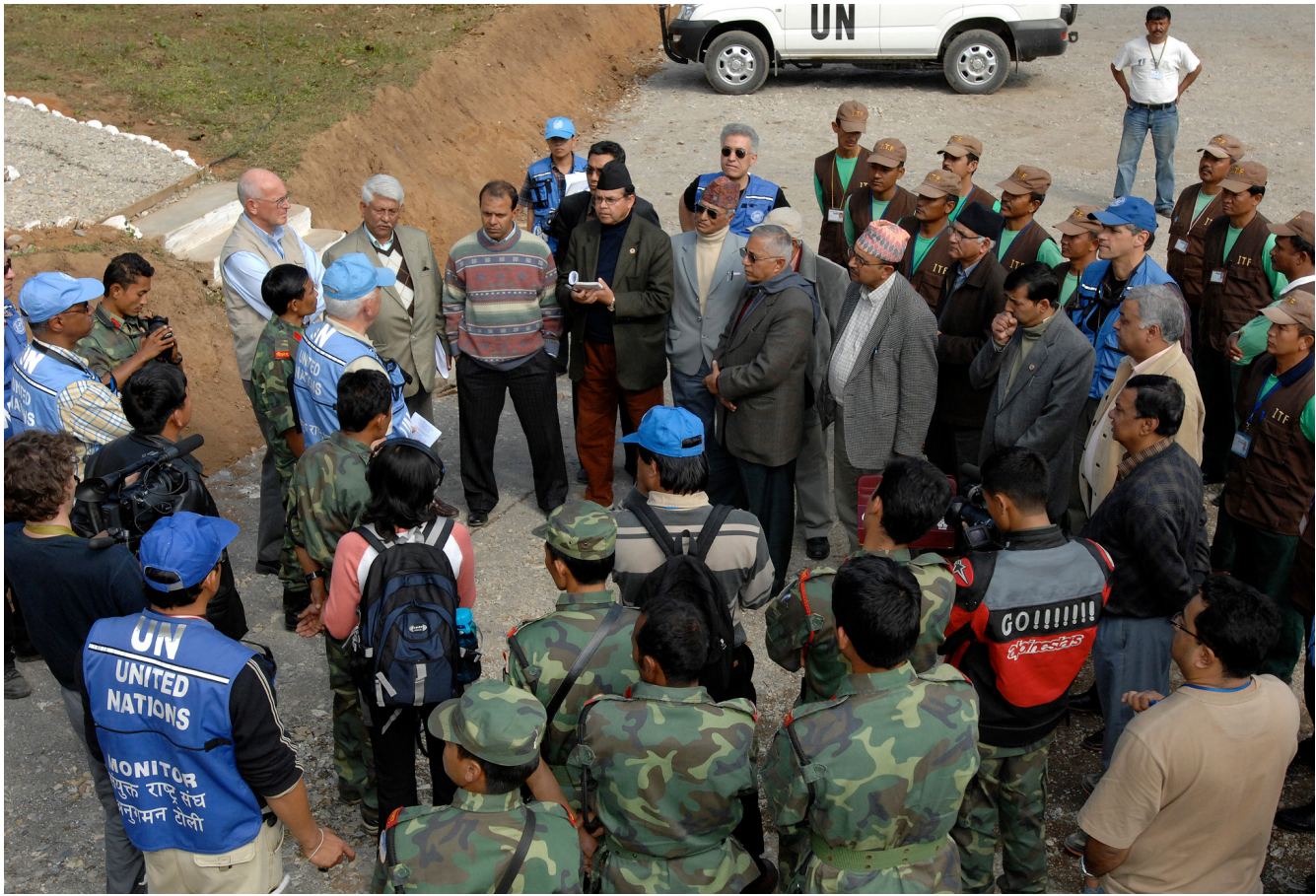
Civilian and military personnel of the United Nations Mission in Nepal (UNMIN) meet with representatives of the Nepal's Seven-Party Alliance.