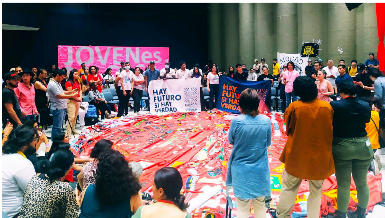
The United Nations Verification Mission in Colombia joins the national meeting, 'Young People in Movement for Cultural Change,' an initiative by the Government of Colombia that acknowledges the significant role of youth in conflict resolution, peace, and reconciliation through dialogue, art, and culture.