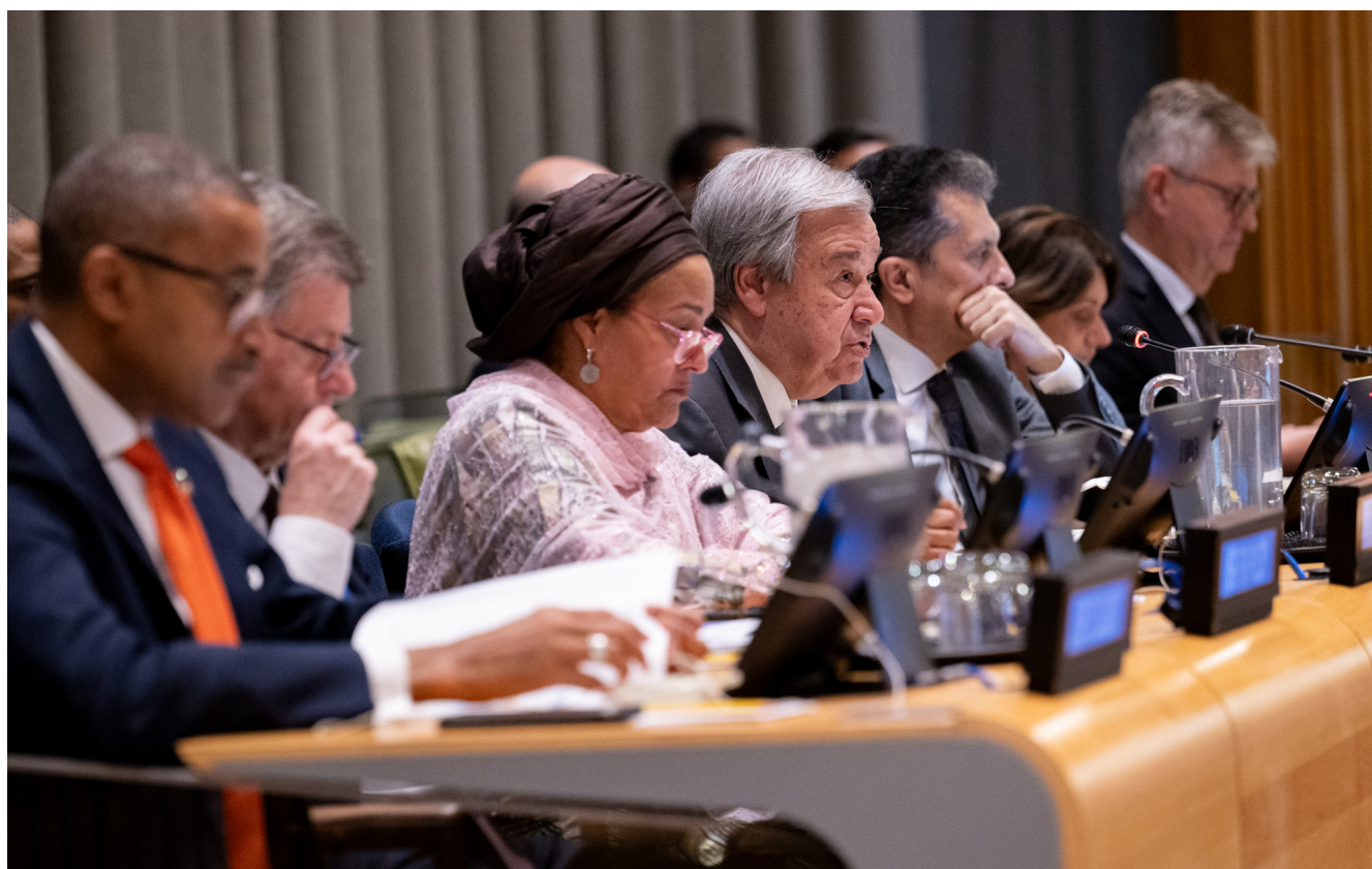
Secretary-General António Guterres (center) releases a new Our Common Agenda policy brief, ‘A New Agenda for Peace’.