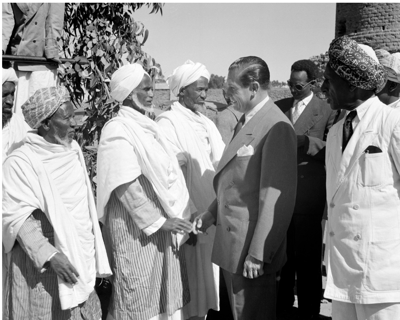
Eduardo Anze Matienzo (second from right), United Nations Commissioner in Eritrea, visits Eritrea.