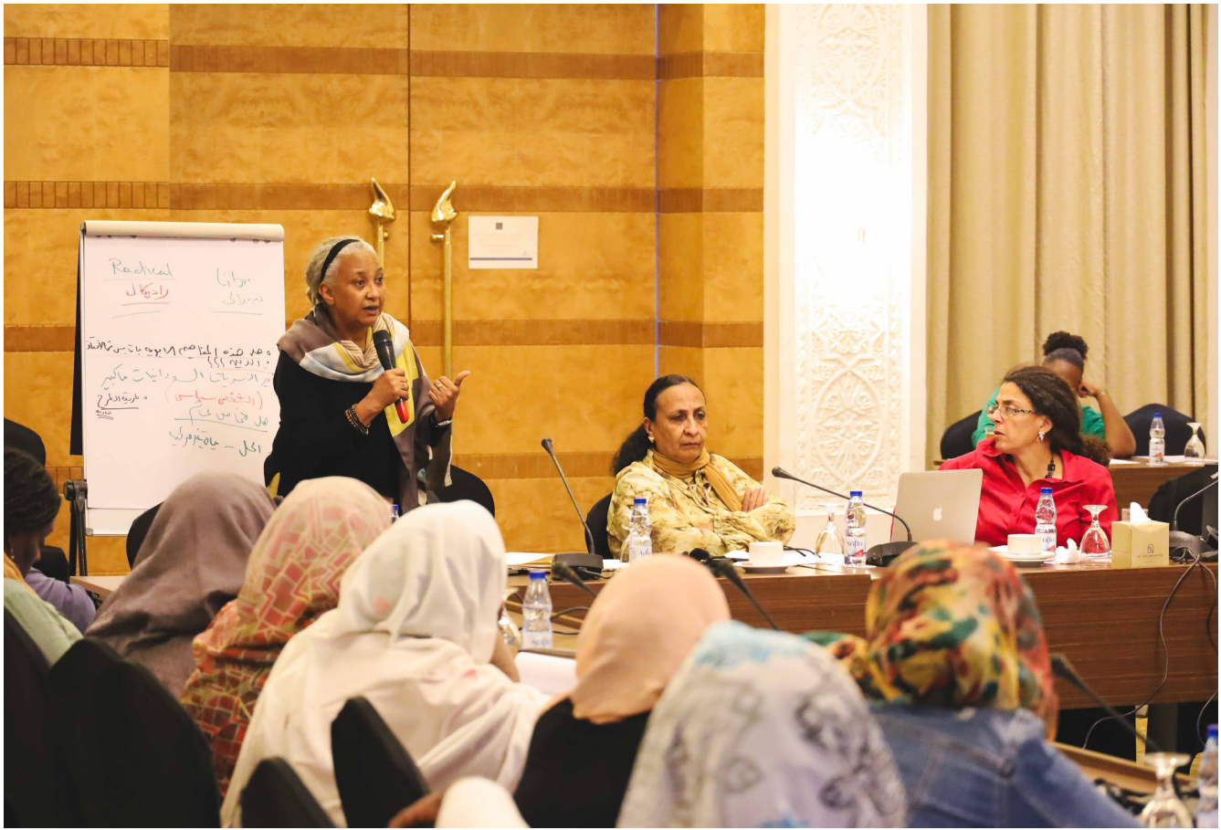
A Sudanese woman speaks at a workshop on women's leadership and participation organized by the United Nations Integrated Transition Assistance Mission (UNITAMS) in Khartoum on 1 December 2022.