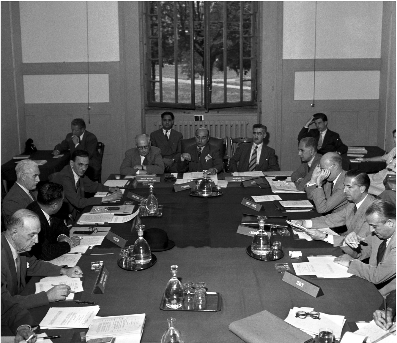
Adrian Pelt, UN Commissioner in Libya, and the Advisory Council to the United Nations Commissioner in Libya meets at the Palais Electoral in Geneva as they prepares the preliminary report for the Secretary-General ahead of the General Assembly in 1950.