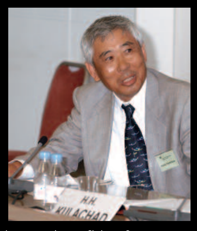
Not all countries are benefiting from globalization. Kunio YOSHIHARA