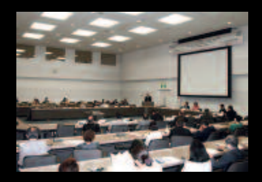
UNITED NATIONS UNIVERSITY, TOKYO