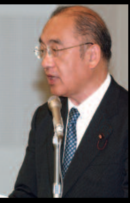
Shogo ARAI, Parliamentary Secretary for Foreign Affairs