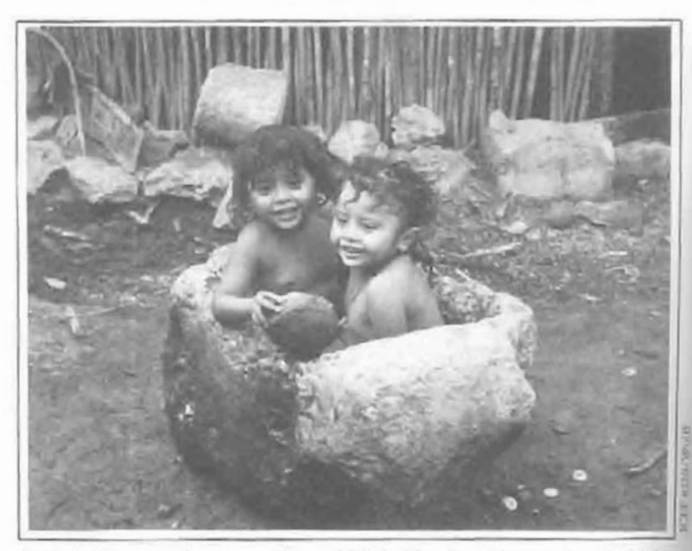
Both cleanliness and play are essential to a child's health and growth in mind and hody. Two ehildren in a poor community in Yucatan, Mexico enjoy a game in their bath-tub: a stone from a Mayan run.

UNICEF is an integral part of the United Nations but it has a semi-autonomous status, with its own governing body and secretariat. A 30-nation Executive Board establishes UNICEF's