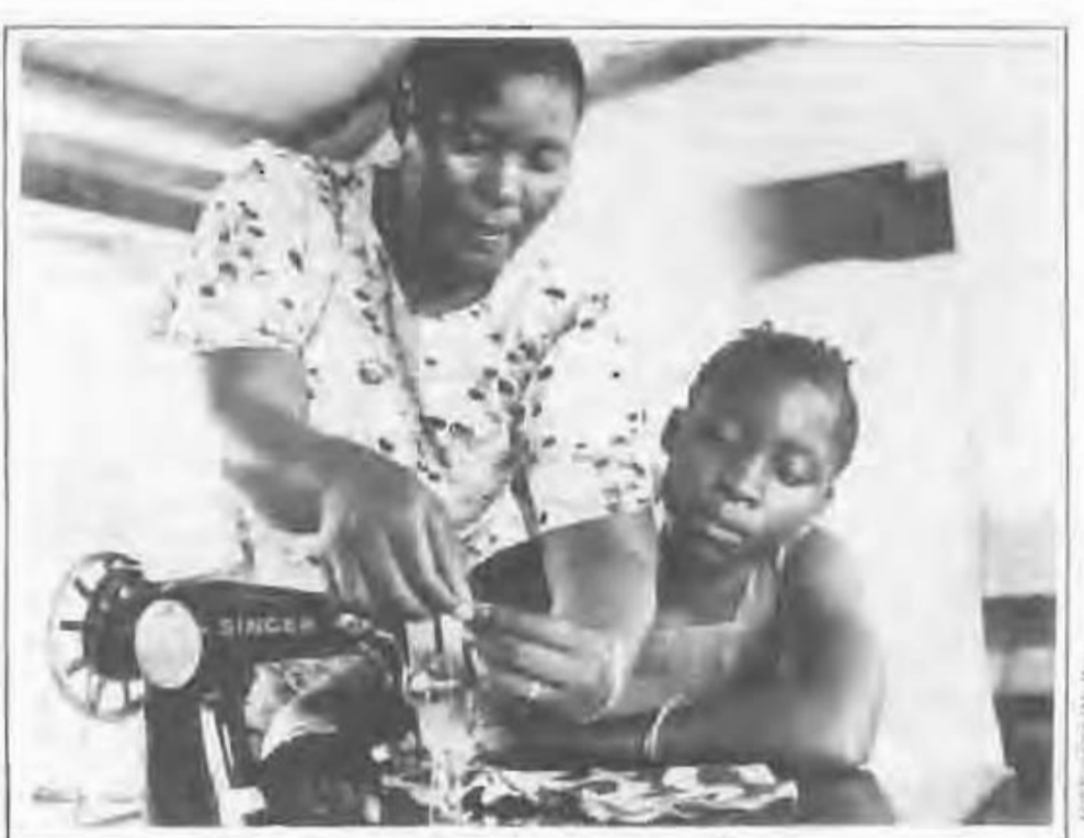
UNICEP's co-operation in programmes to assist women and older girls usually insertaony emphanis on developing meaning generating shifts and opportantities. In this community senior in Tanzania older girls are instructed in subseting and dress making.

Most country programmes continue to stress women's activities as companents of basic services, with a number of them now venturing more energetically into programmes which enable women to embark on activities which provide an income and to participate in community affairs. LINICEF's increased involvement in programmes of this kind reflect an important evolution in UNICEF's co-operation in relation to women. Originally, women were a target group for UNICEF assistance specifically in their nurrating roles. Recognizing the increasing numbers of women who are heads of bousehold in the developing countries, and the small economic tole which women play in many societies. UNICEF's policy is now to cooperate in national services in which women are viewed in their multiple roles.