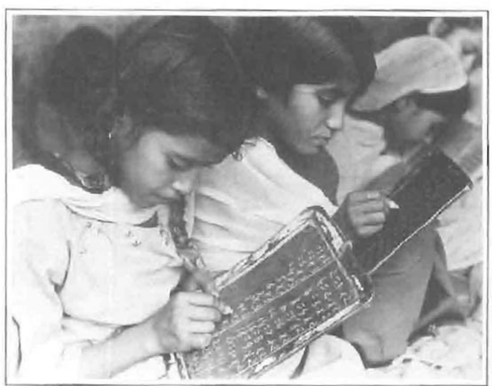
In rural schools in Pakistan, young girls do their arithmetic lessons on slates. UNICEF is anxious to extend co-operation to programmes, which will increase girls' school enrolment. There is a link between female literary and higher health and nutrition standards.

In Jamaica, work has begun on the assessment of the situation of women, children and youth in low-income areas of Kingston. Similar activity undertaken in Mexico City during IVC led to a district