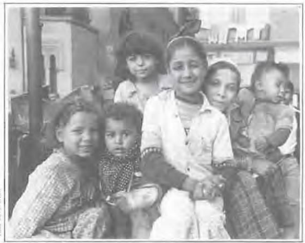
the the back dreats in Caro-older children look after their young brother, and inters, and exade happy self-simplements

session. UNICEF has also increasingly sought collaboration with bilateral agencies a field level to channel more bilateral resources into programmes which UNICEF cannot fund by levelf