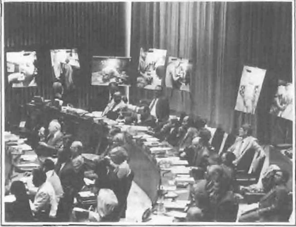
UNICEF's regular annual session of the Executive Board met in New York in May 1981. New programme commitments totalling $305 million were given firm approval by the 30 member Board, and a number of policy reviews were discussed.