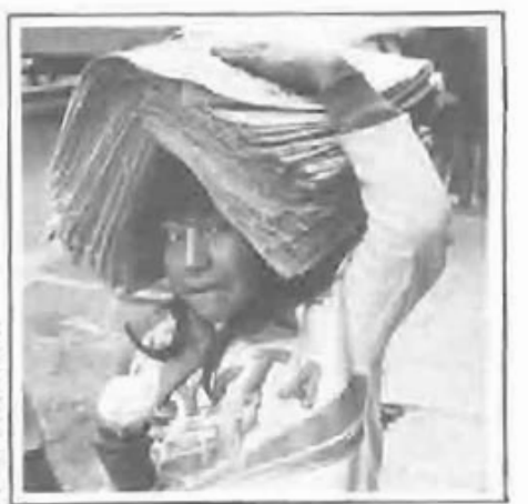
Children of the uthan poor, like this gif in Ecuador, start earning early.

During 1980, stipends were provided for the training of 7,000 people, of whom the majority were handpump caretakers and other maintenance workers, and others included village leaders, women and girls, nurses and midwives, and child welfare workers,