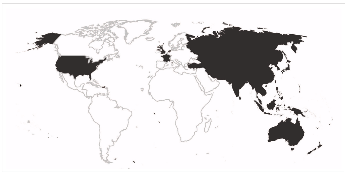
The shaded areas of the map indicate ESCAP members and associate members.*

The Economic and Social Commission for Asia and the Pacific (ESCAP) is the most inclusive intergovernmental platform in the Asia-Pacific region. The Commission promotes cooperation among its 53 member States and 9 associate members in pursuit of solutions to sustainable development challenges. ESCAP is one of the five regional commissions of the United Nations.