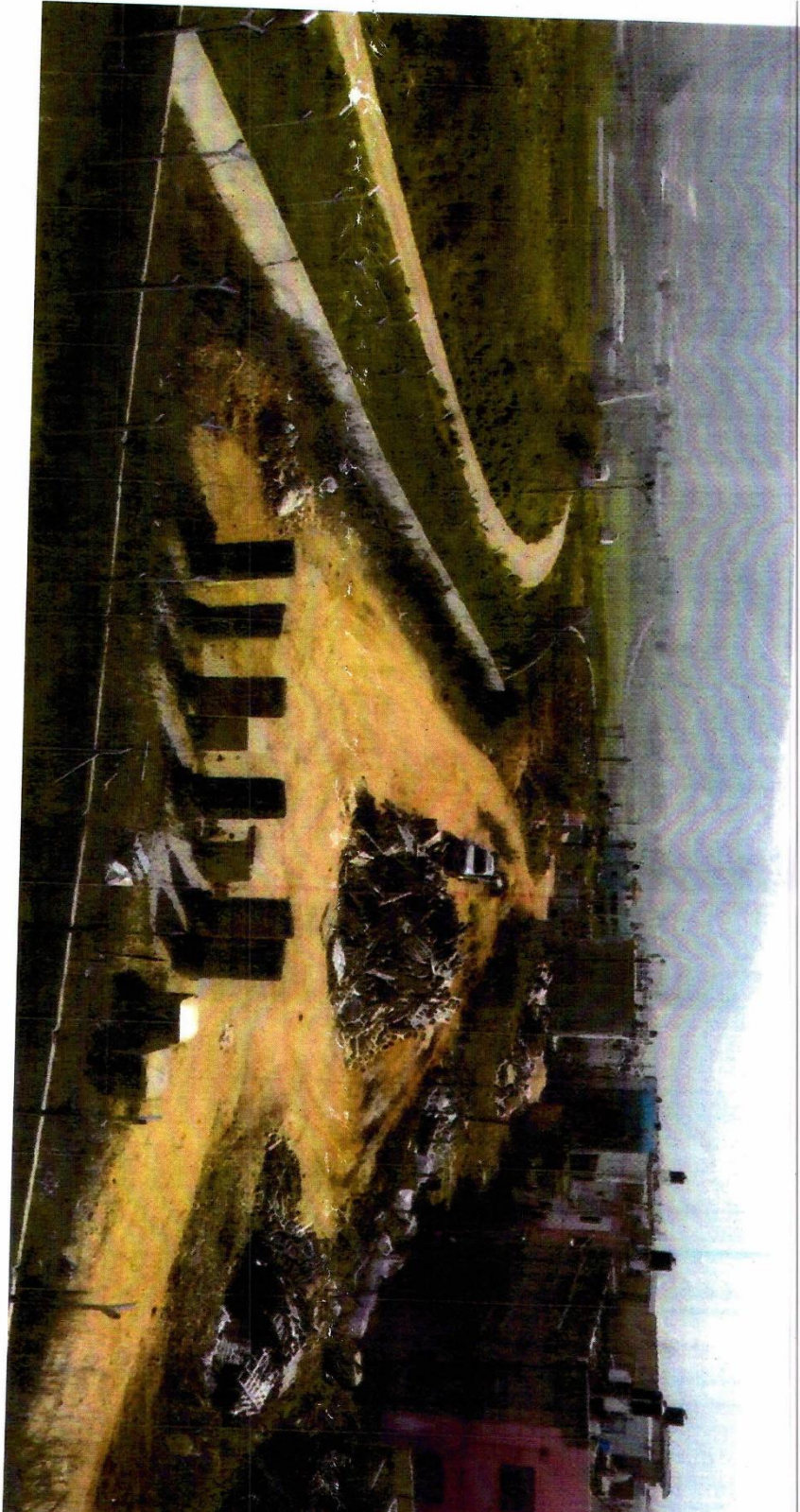
مشى للسباح بعد تشييده