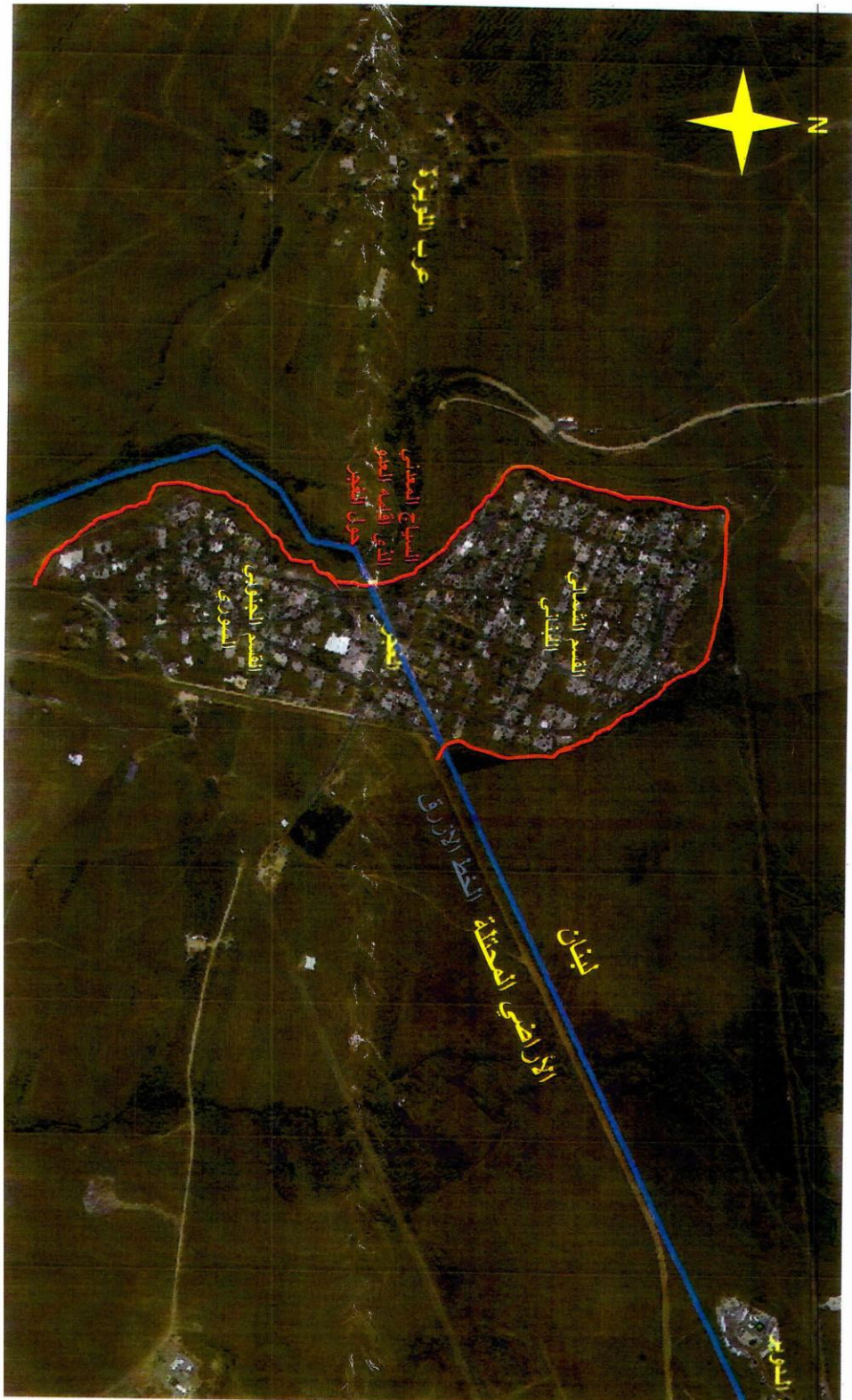
مشهد عام لبلدة الفجر ومحيطها