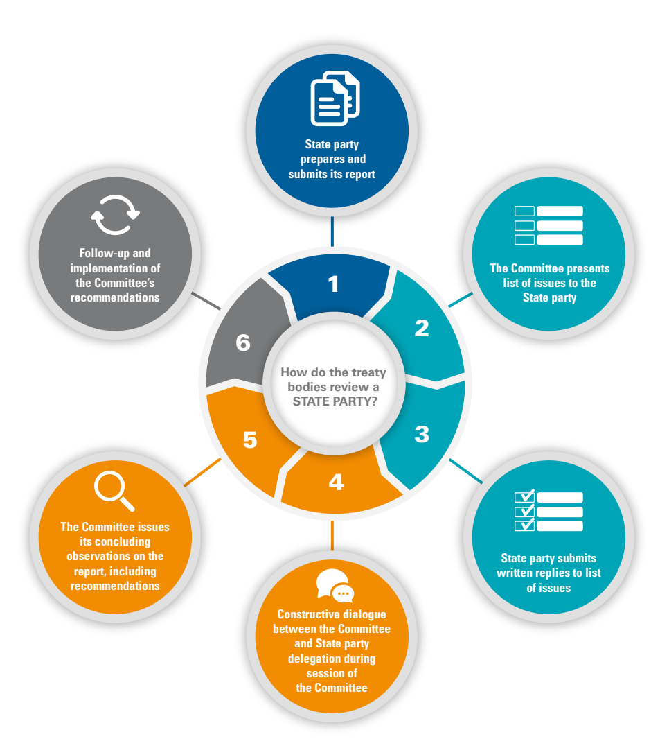
Figure 1: The reporting cycle to treaty bodies<sup>272</sup>