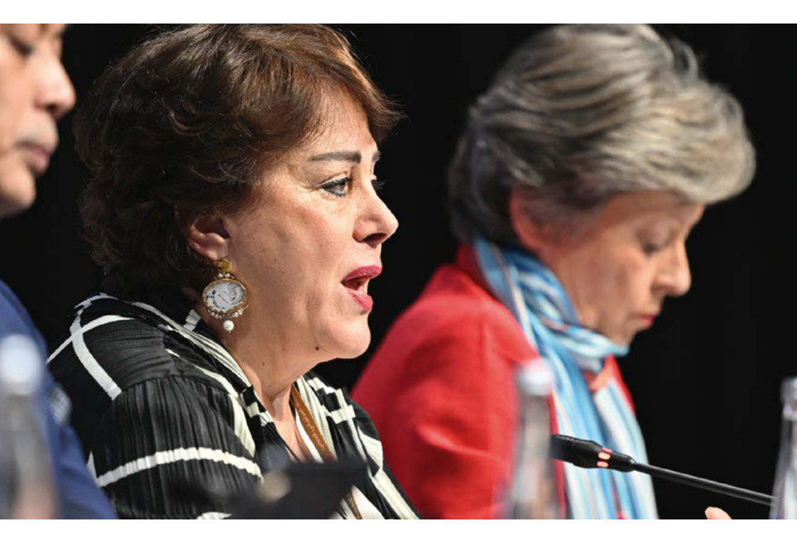
CEDAW Committee members are often invited to address parliamentarians during IPU events to raise awareness of the Convention.

The IPU works closely with parliaments to advance the CEDAW Convention and its Optional Protocol. The CEDAW Committee has a unique relationship with the IPU, which is beneficial for parliaments and to the fulfilment by the Committee of its mandate. This part of the handbook discusses this relationship and the specific role of the IPU in engaging parliaments on the CEDAW Convention.