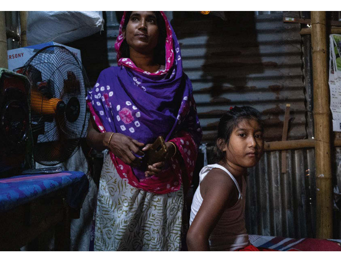
Due to climate change and related disasters, girls are at increased risk of being forced into child marriage.

Disaster risk reduction and climate change