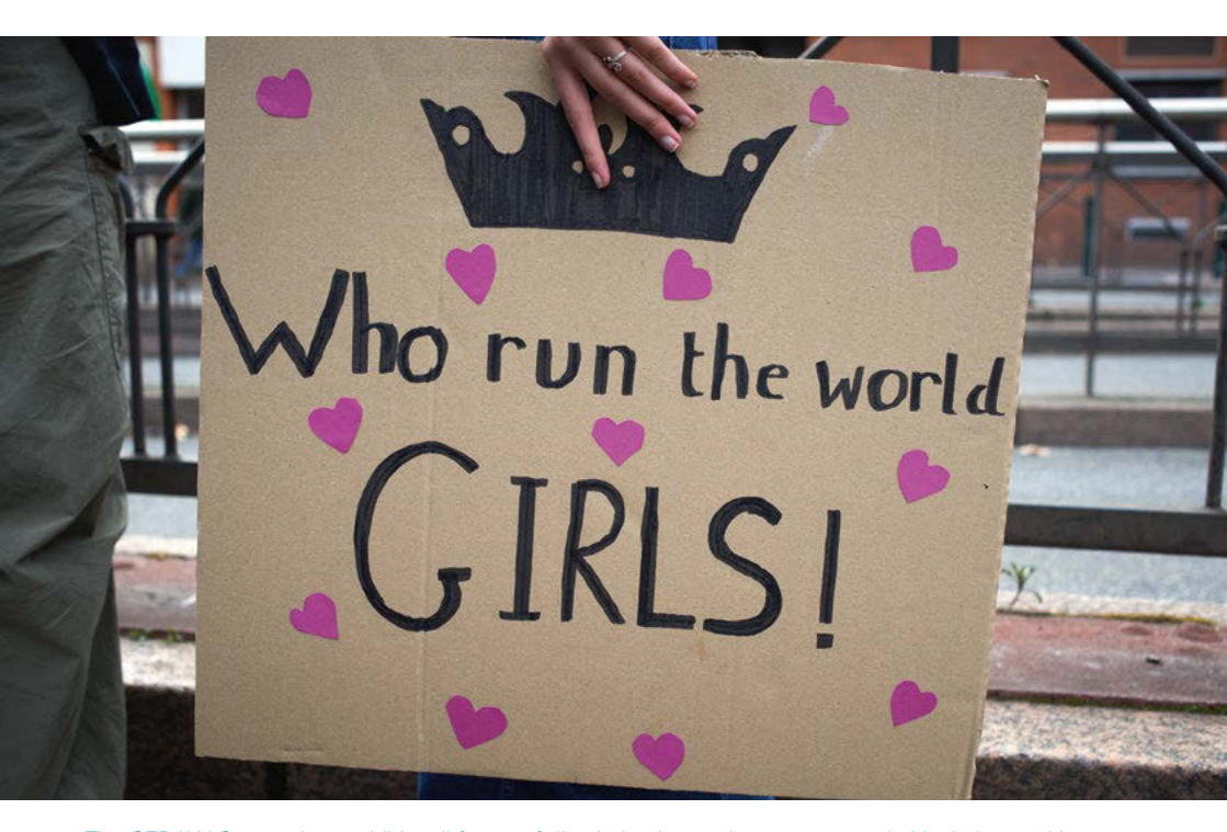
The CEDAW Convention prohibits all forms of discrimination against women and girls, in law and in practice.

Part II.2 illustrates the CEDAW Committee's approach and possible action by parliamentarians in relation to two specific rights protected by the Convention: protection of women and girls from gender-based violence, and women's political and public participation. The discussion related to these rights makes links with other rights included in CEDAW.