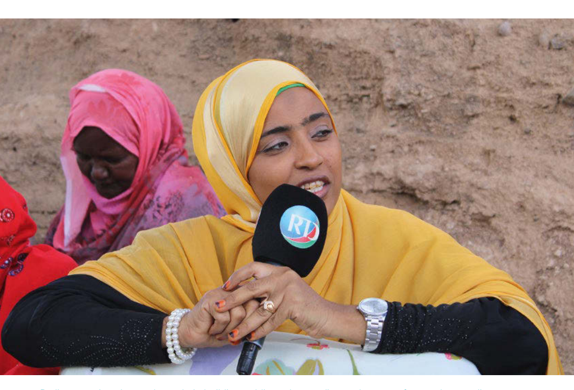
Parliamentarians have a key role in building public understanding and support for gender equality.

In their interaction with the public, parliamentarians promote changes in the social norms, traditions, cultures, social stereotypes, beliefs and misconceptions that contribute to ongoing gender-based discrimination between women and men, girls and boys.