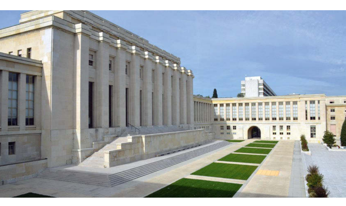
The United Nations CEDAW Committee regularly meets in Geneva to review States parties' compliance with the Convention.