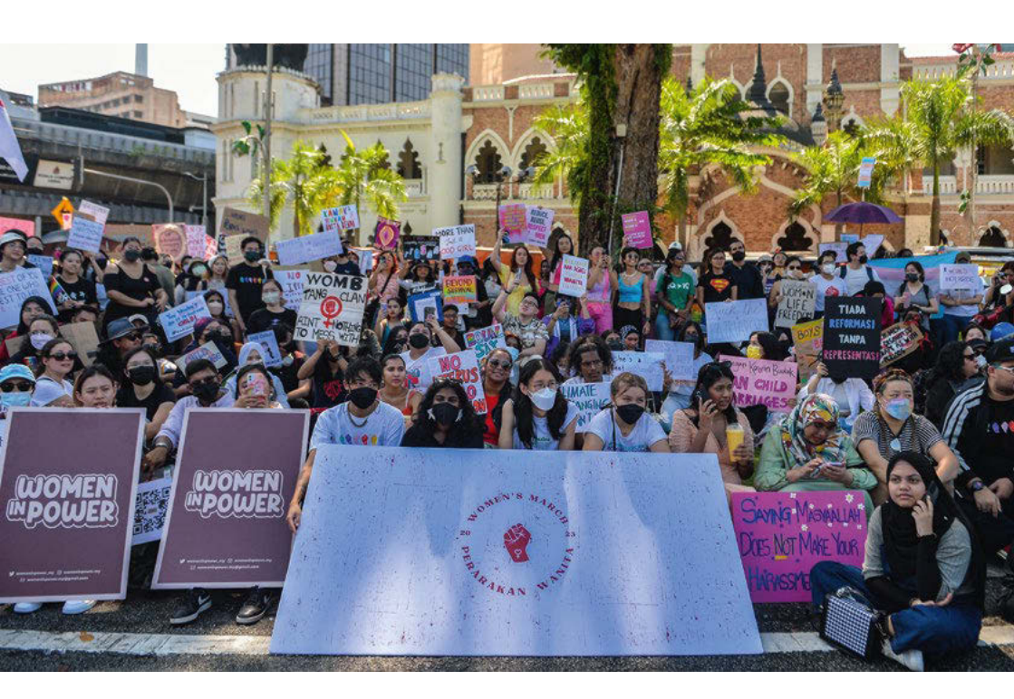
The CEDAW Convention, also known as the international bill of rights for women, requires States parties to take specific actions to guarantee women's rights.

This part of the handbook focuses on the CEDAW Convention, its Optional Protocol and the role of the CEDAW Committee. It shows how CEDAW fits within the international human rights system, presents the CEDAW Convention and its key features, and reviews the nature of States' obligations.