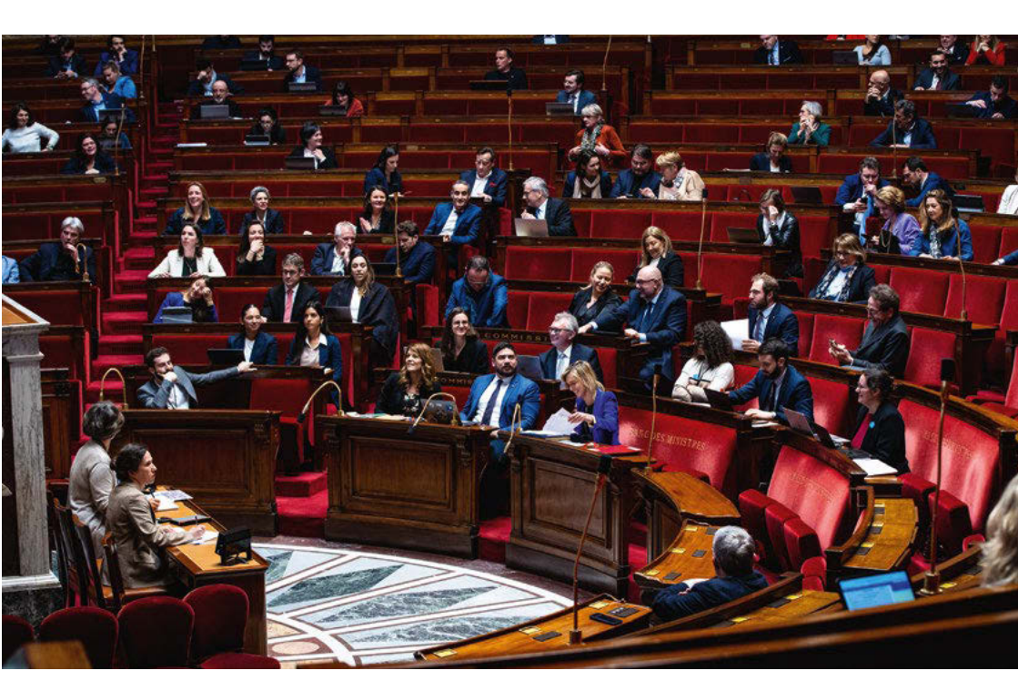
Achieving women's equal participation in politics requires positive measures, such as gender quotas.

For additional guidance on recommended action in this area, see CEDAW Committee, General recommendation No. 38 (2020) on trafficking in women and girls in the context of global migration.