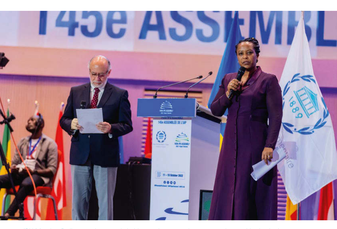
IPU Member Parliaments have made bold commitments to become gender-sensitive institutions.

For parliaments and parliamentarians to play their role in advancing the implementation of the CEDAW Convention alongside other branches of government and stakeholders, it is essential to enhance parliaments' own capacities, internal institutional structures and working methods. This part of the handbook discusses how parliaments can be gendersensitive institutions, explores the institution's relationship with other stakeholders and examines the challenges and opportunities associated with parliaments and parliamentarians promoting the CEDAW Convention through their work.