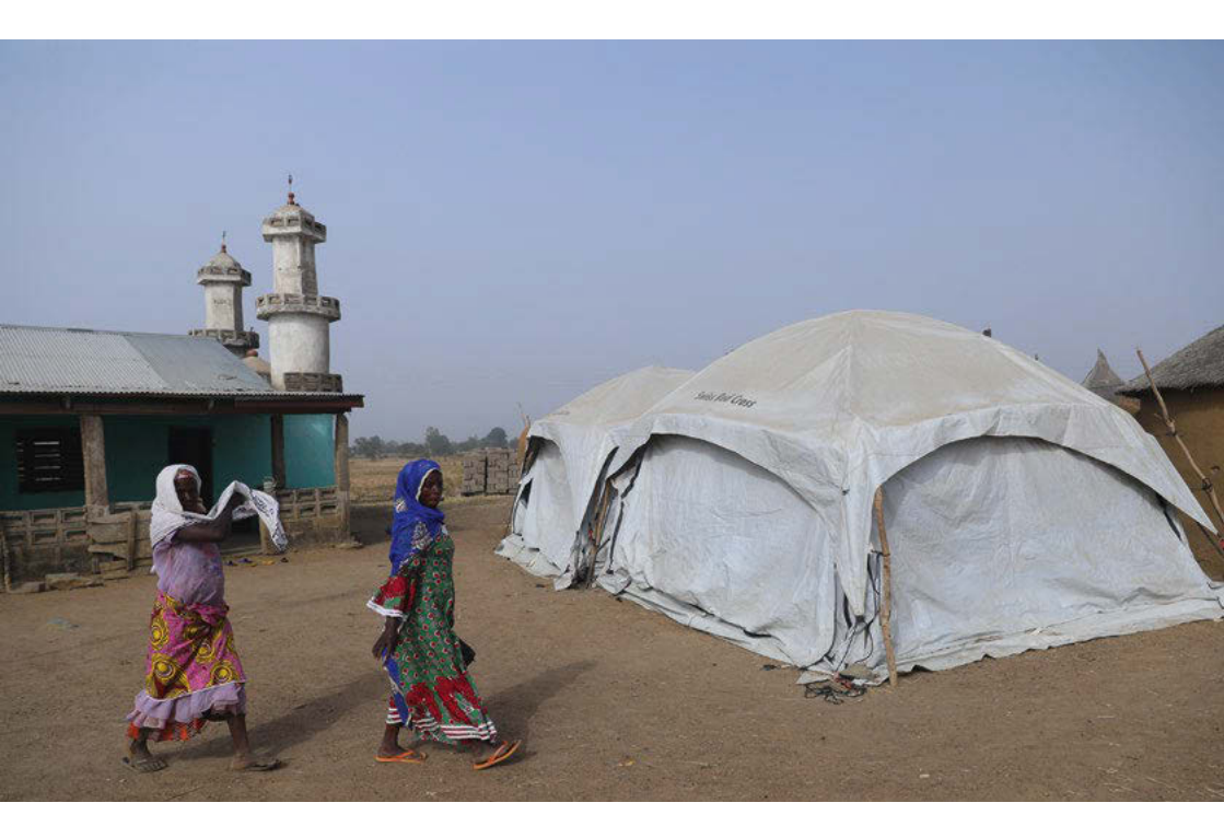
Many women and girls face multiple forms of discrimination, such as on the basis of their refugee status, in addition to their gender, which put them at increased risk.

The CEDAW Committee considers that intersectionality is a basic concept for understanding the scope of the general obligations of States parties under the CEDAW Convention and that States parties should legally recognize and prohibit such intersecting forms of discrimination and their compounded negative impact on women. The Committee has also stressed that intersecting forms of discrimination may affect women and girls in different ways than boys and men who find themselves in similar situations.<sup>91</sup>