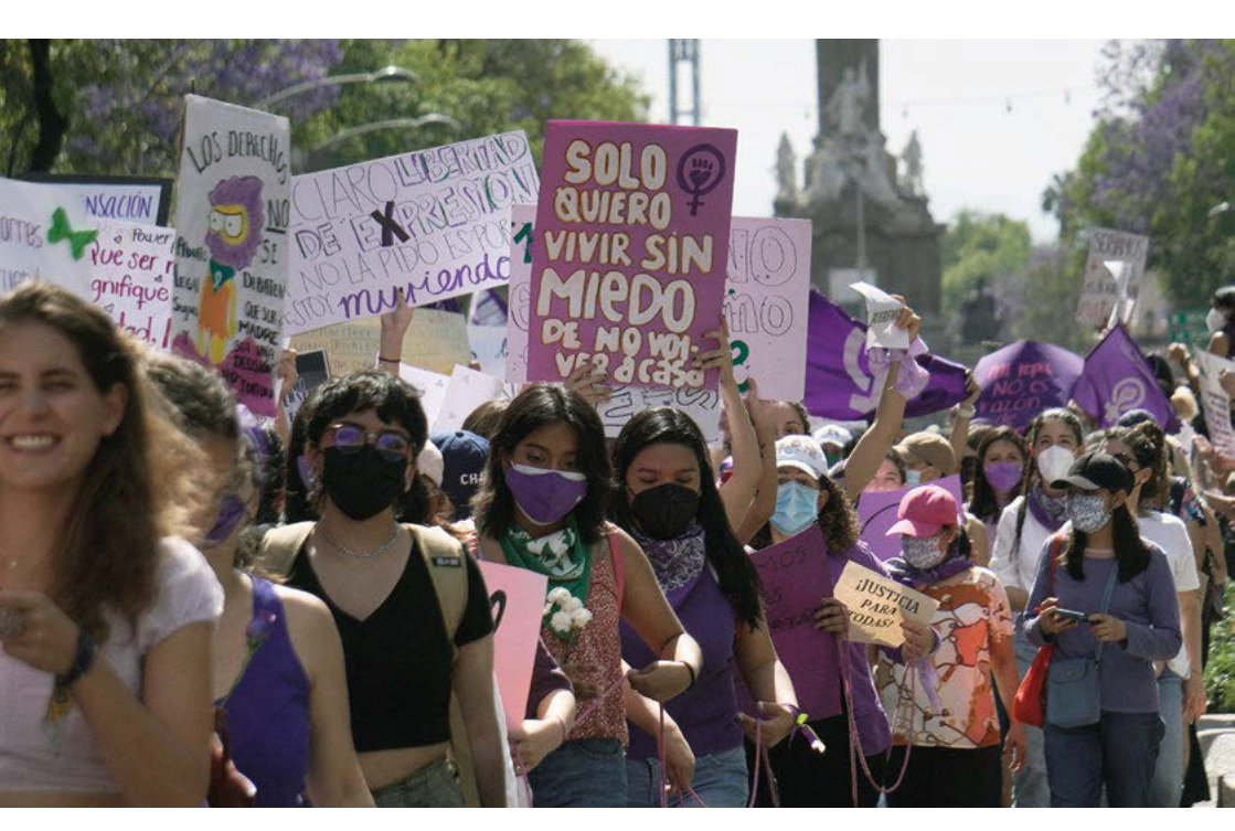
Gender-based violence prevents women and girls from enjoying their rights and freedoms, violates their dignity and puts their lives at risk.