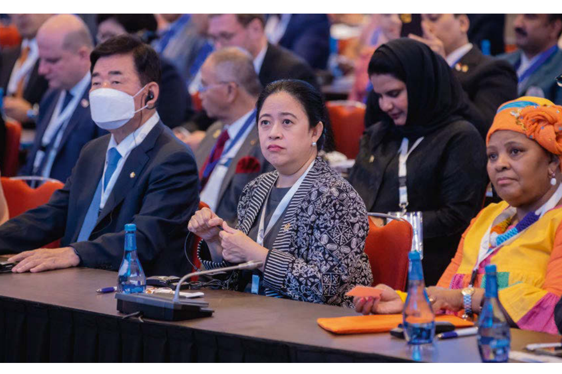
Parliamentarians have an essential role in ensuring that the provisions of CEDAW become a reality for all women and girls.