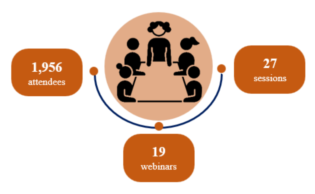
Figure III Capacity development reach in 2022