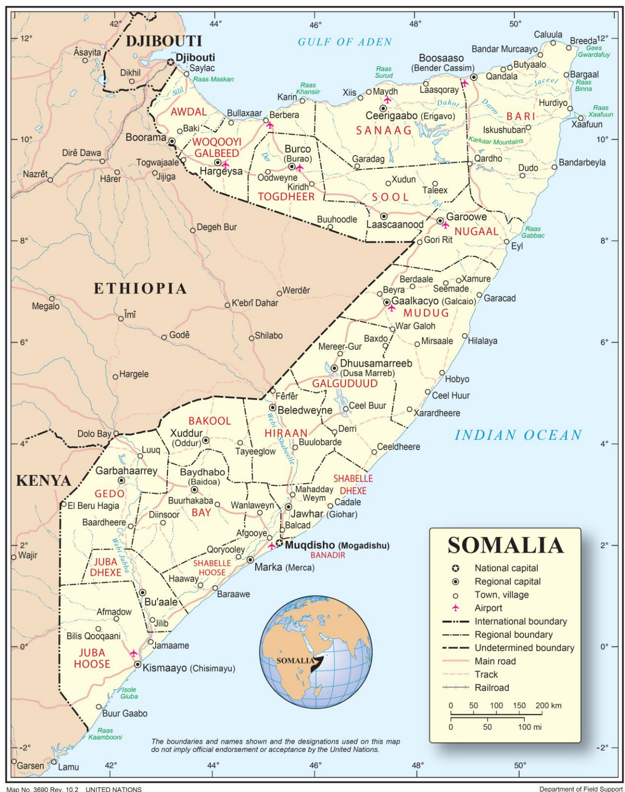
Map No. 3690 Rev. 10.2 UNITED NATIONS