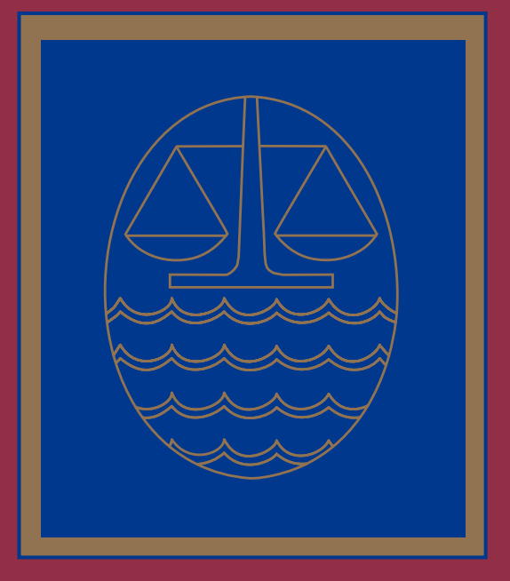
Division for Ocean Affairs and the Law of the Sea Office of Legal Affairs