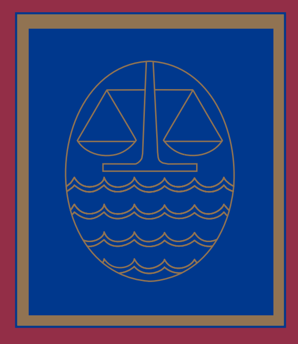
Division for Ocean Affairs and the Law of the Sea Office of Legal Affairs