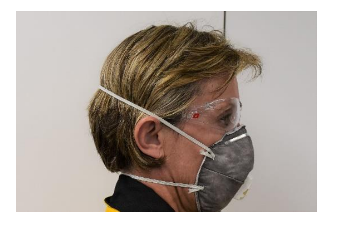
Step 3 : When wearing goggles with an N95 respirator mask, place the goggles against the face in a comfortable position above the top of the respirator mask.

Step 1 : When wearing safety glasses with an N95 respirator mask, place glasses on after securing the respirator mask. Ensure the glass are resting on the bridge of the nose <u> above </u> the top of the respirator mask.