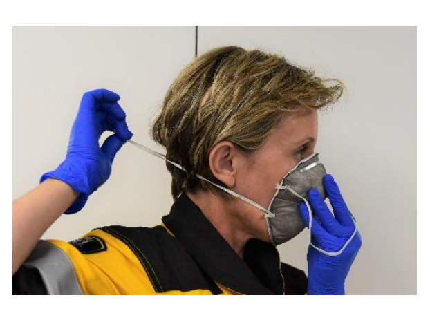
Step 4 : Pinch or press the metal nose clip around your nose to achieve a secure seal.

Step 2 : Lift the lower elastic strap over the head and position below the ear.