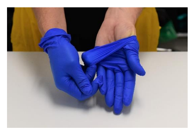
Step 4 : With the un-gloved hand, slide a finger/s <u>under</u> the cuff of the remaining glove at the top of the wrist without touching the outside of the glove.

Step 2: Peel the glove downwards, away from the wrist and down toward the fingers turning the glove <u>inside-</u> out as it is pulled down