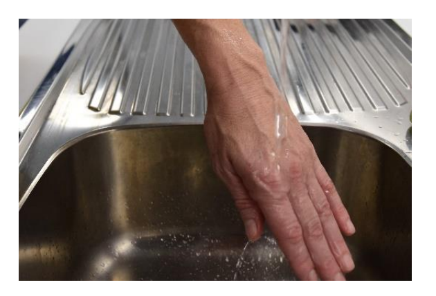
Step 6 : Wash hands and any exposed skin, such as wrists or arms thoroughly with soap and water.