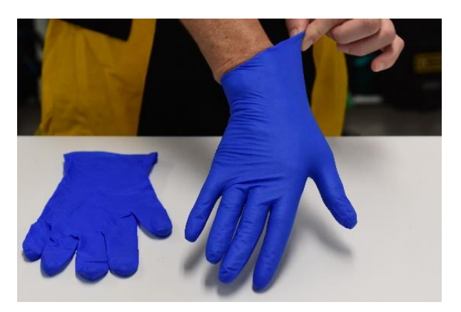
Step 4 : Pull the cuff of the second glove up the wrist making sure the cuff is fully extended and the wrist is covered.

Step 2 : Insert one hand into the first glove and pull the cuff of the glove up to the wrist making sure the cuff is fully extended and the wrist is covered.