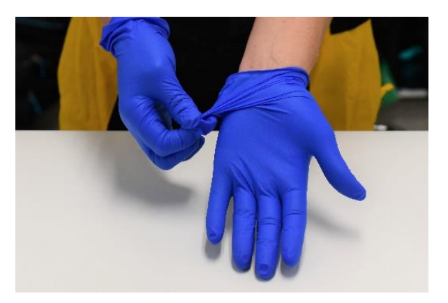
Step 3 : Pull the glove downward until it is removed from the hand, holding the now <u>inside-out</u> glove in the palm of the remaining gloved hand.

Step 1 : To remove the gloves correctly, first pinch and hold the <u>outside</u> of one glove at the top of the cuff and pull away from the wrist.