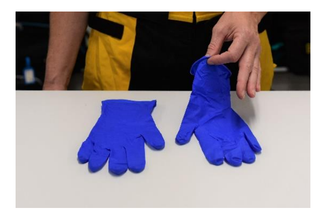
Step 3: Insert the second hand into the other glove.

Step 1 : To put on the gloves correctly, first select the appropriate size of nitrile gloves, gloves should not be loose on the palm or fingers.