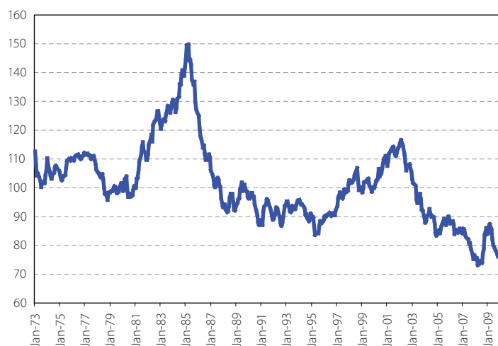
Figure 1: Dollar exchange-rate index against other major currencies (January 2000=100)

The major currencies index contains currencies of most developed countries. A decline in the index represents a depreciation of the dollar.