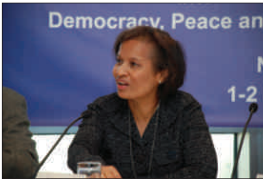
Ms. Geraldine Fraser-Moleketi, Director, Democratic Governance Practice, Bureau for Development Policy BDP/UNDP