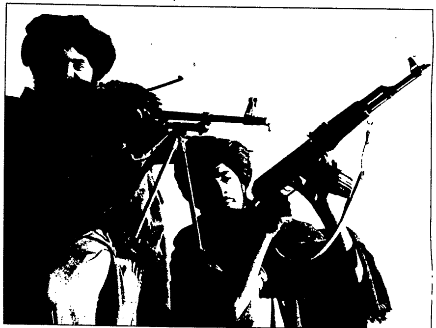
No mercy: men, women and children were murdered in their homes as Taliban gunmen took over Mazar-e-Sharif