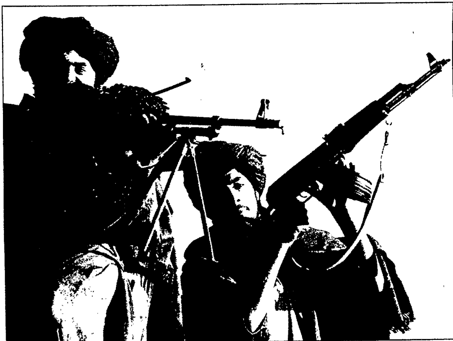
No mercy: men, women and children were murdered in their homes as Taliban gunmen took over Mazar-e-Sharif