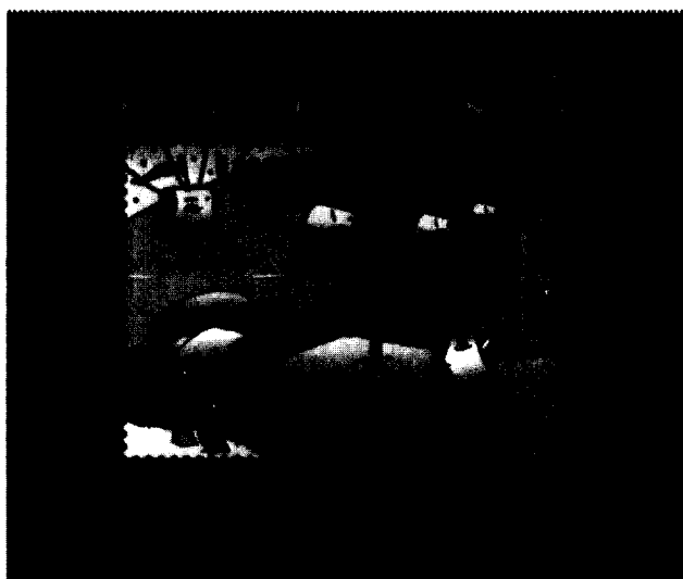
US$ 1.00 (overprinted)