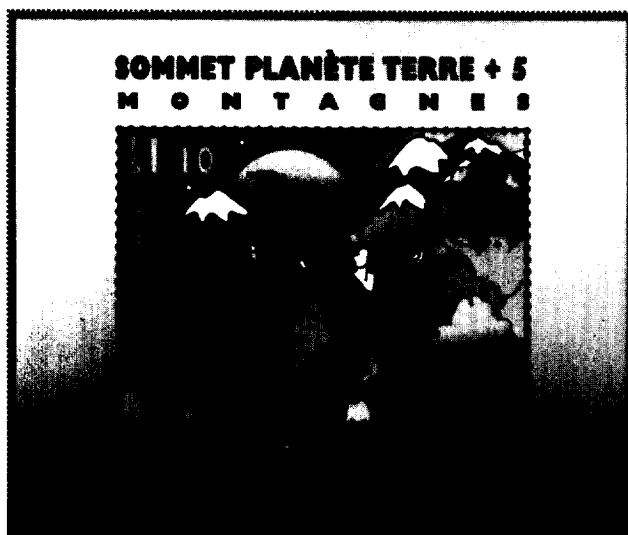
Sw F 1.10