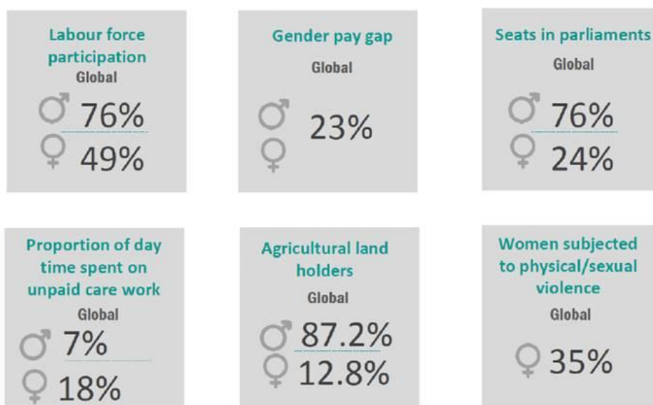
Figure 1. Global gender gaps