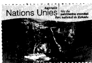
S.Fr. 0.90 Kakadu National Park

2. The stamps will be issued in three currencies (US dollar, Swiss Francs and Austrian Schillings). The denominations of the stamps are S.Fr. 0.90 and 1.10, US$ 0.33 and 0.60, AS 4.50 and 6.50.