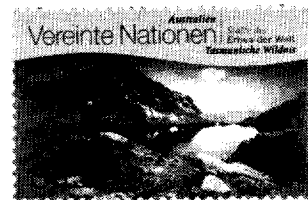
AS 6.50 The Tasmanian Wilderness