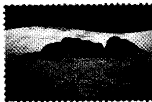
AS 4.50 Uluru Kata Tjuta National Park